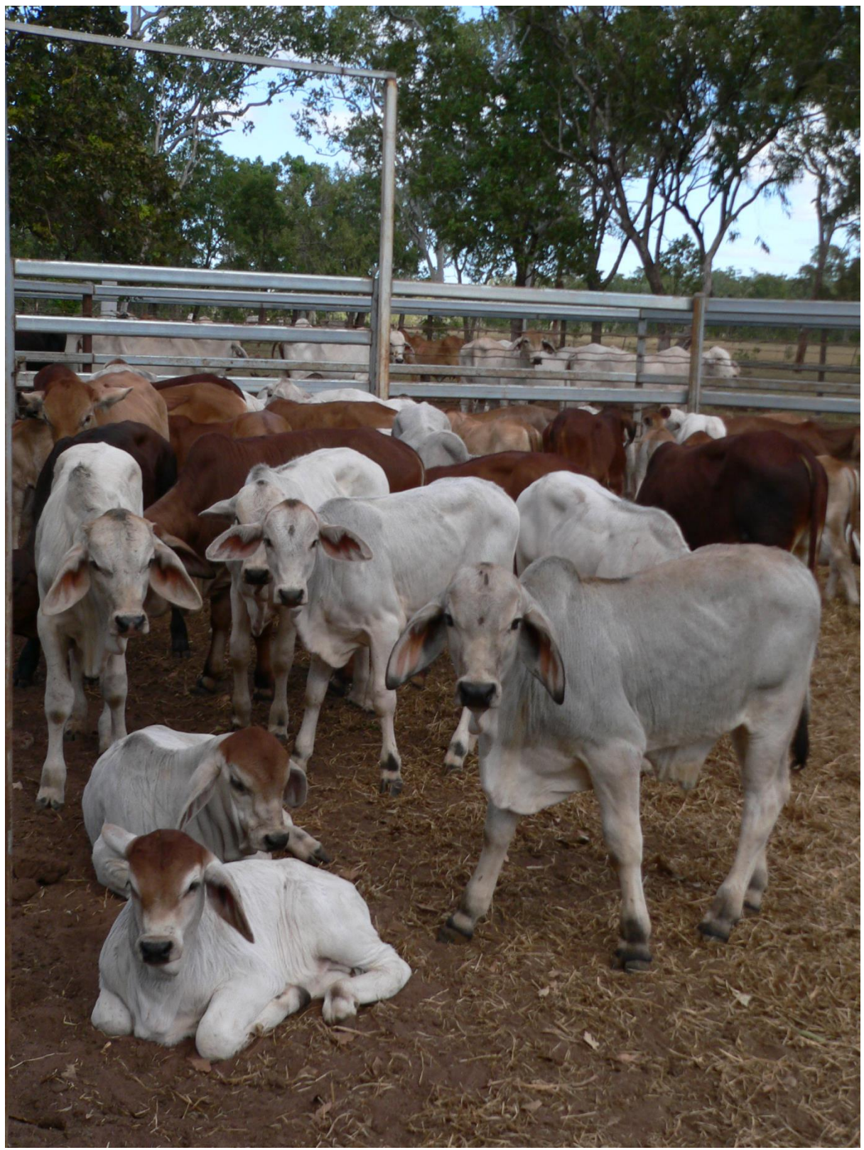
2012 Progeny from FTAI program at Lakefield Station