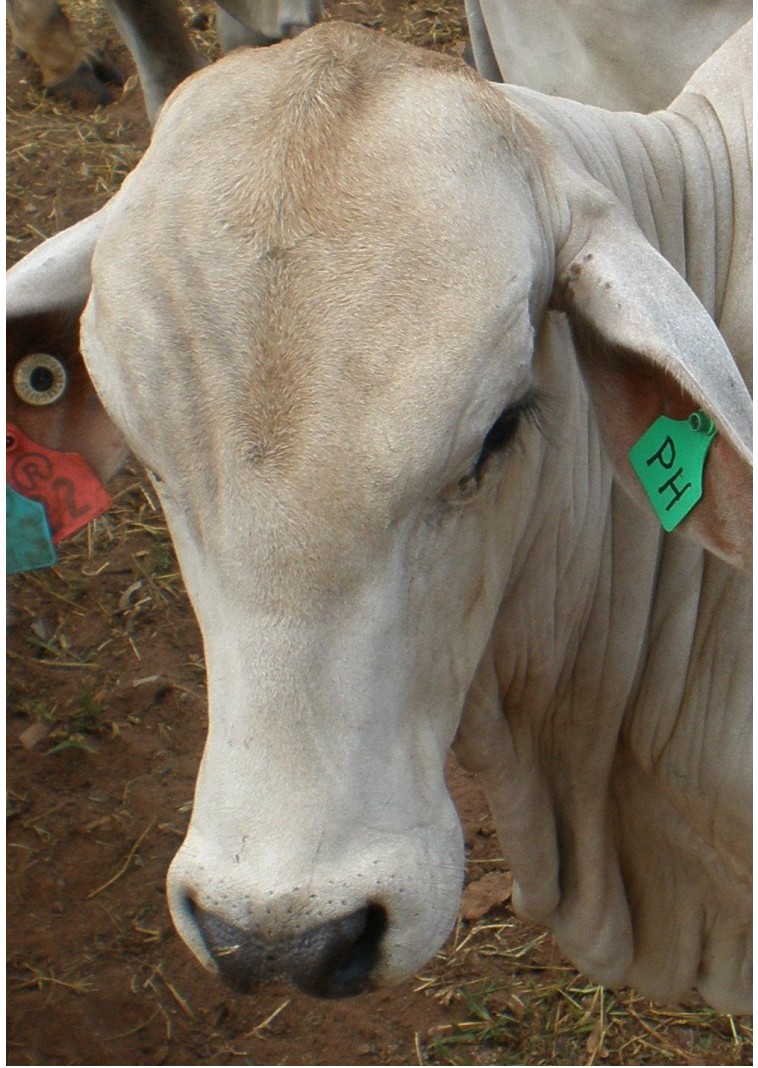
A PH 2010 bull @ 2yo