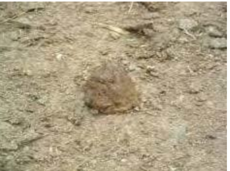
Figure 1-4 - Faecal consistency score 4 - runny manure; forms a loose pile