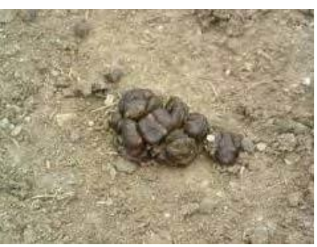
Figure 1-2 - Faecal consistency score 2 – thick manure