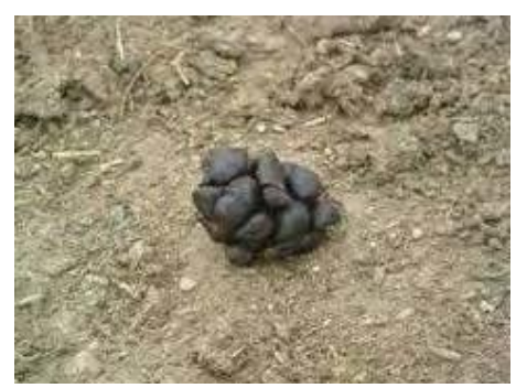
Figure 1-1 – Faecal consistency score 1 – hard pellets

Faecal consistency can be estimated on a scale of 1 to 5, where hard pellets would be considered 1, and fluid faeces are a 5. Monitoring faecal consistency is an important tool in identifying and managing acidosis and other health and nutritional disorders.