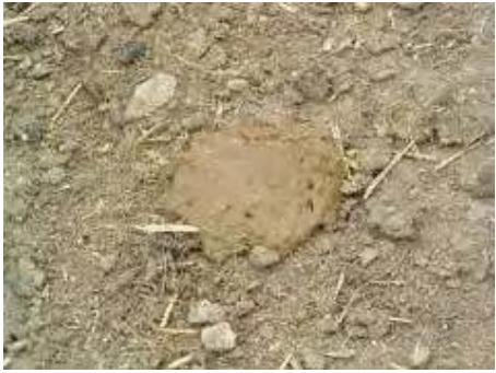
Figure 1-5 - Faecal consistency score 5 - very liquid manure; includes diarrhoea