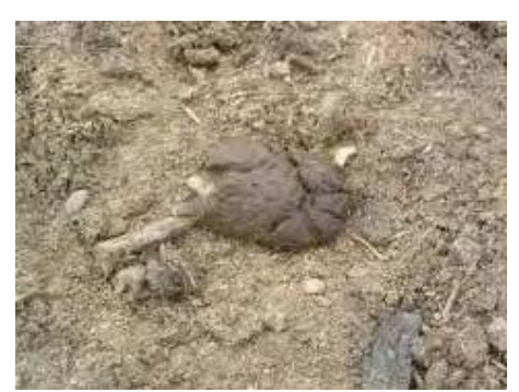
Figure 1-3 - Faecal consistency score 3 - porridge-like consistency; forms a soft pile