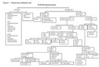
Figure 1: Enterprise profitability tree