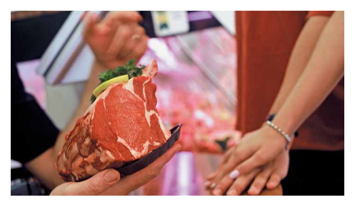
A butcher showing MSA quality meat.