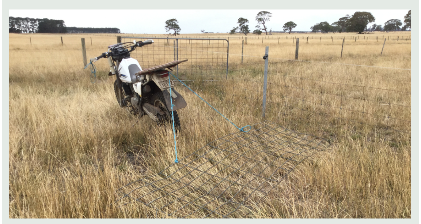
Seedling recruitment intervention strategy