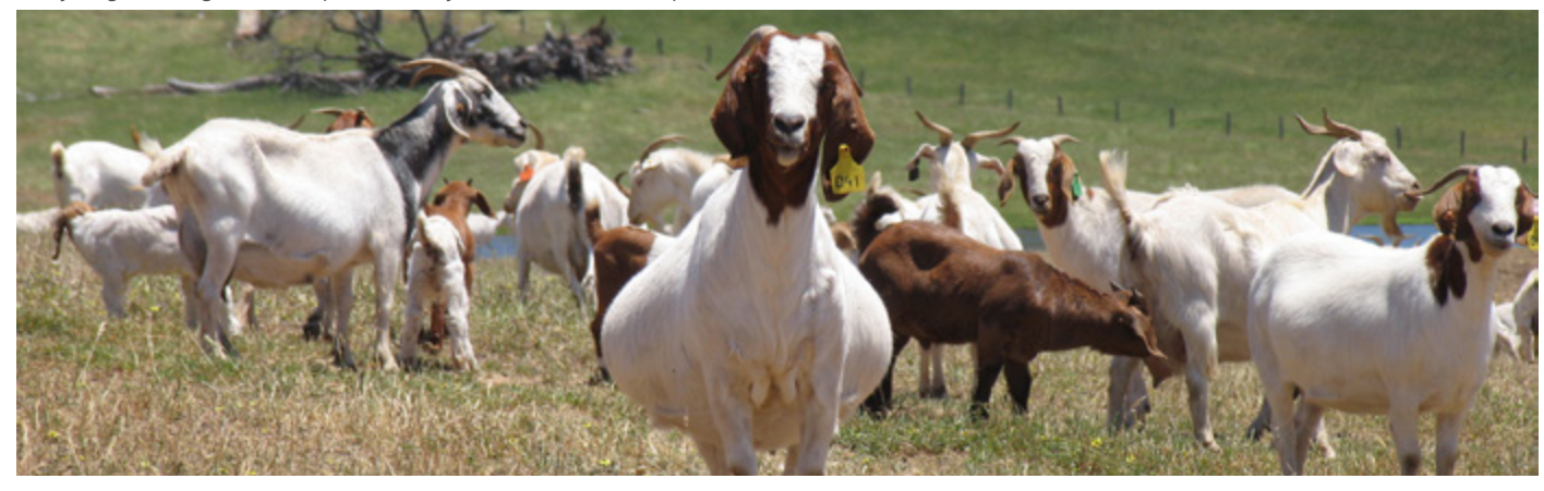
Many stages throughout the reproductive cycle influences overall performance

The example in Table 1 allows producers to consider the potential benefit of increasing fecundity and cost strategies to achieve this, such as supplementary feeding to optimise condition score at joining to maximise fecundity or ensuring the correct buck-to-doe ratio is maintained and fertility is optimised. This may also help demonstrate the cost associated with out-of-season joining; fecundity would likely be reduced and fewer kids weaned – is the increased price on offer for out-of-season product sufficient to offset the reduced number of saleable animals?