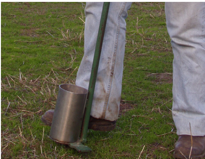
Using a soil sampler makes soil testing easier

Soil sampling involves taking a number of cores of a consistent size and at a consistent depth. Specially designed soil samplers which take a 10cm core are preferable to using a shovel. A shovel will take samples at variable depths and collect too much soil per sample.