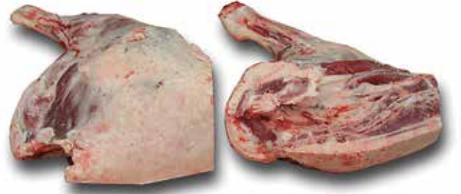
Figure 3: Tenderstretched hindquarters.

Tenderstretch hanging provides an alternative to electrical stimulation for achieving sheepmeat of good eating quality. It is particularly beneficial for improving the eating quality of loin and hindquarter cuts. This method is well suited to the domestic market where rapid tenderisation is important and electrical stimulation is not a valid option.