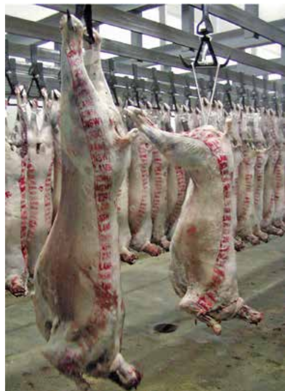
Figure 1: Conventional Achilles hanging (left) and tenderstretch hanging.