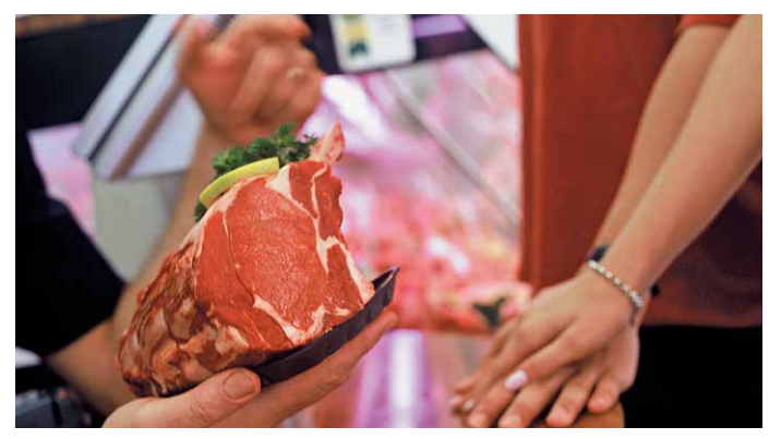
A butcher showing MSA quality meat.