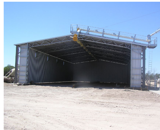
Grain can be temporarily stored under cover. This grain storage shed has a permanently mounted central discharge auger for loading the shed.