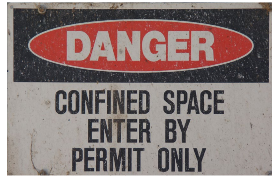
Safety - confined space warning on silo.

Quality can deteriorate rapidly in uncovered grain piles. Grain temperature and moisture content should be checked at several locations every two or three weeks.