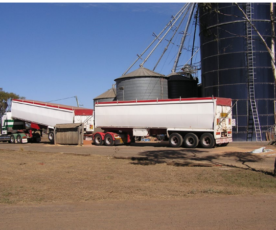
A permanently situated, drive-over grain receival hopper for fast unloading of trucks.