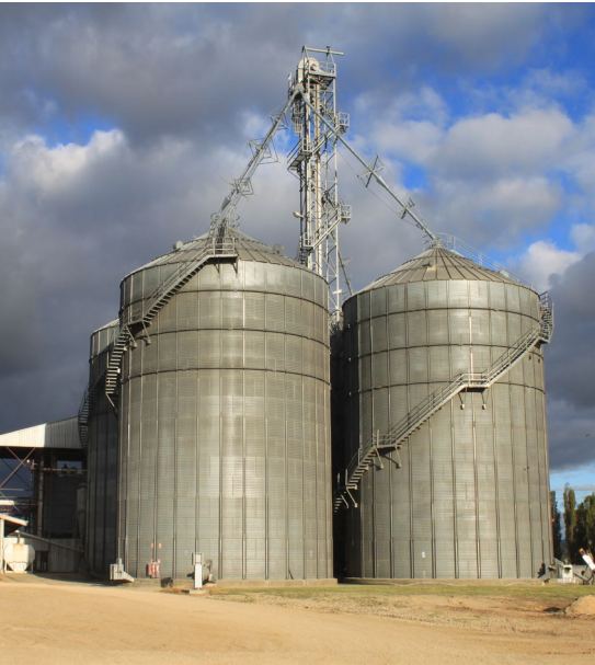
Large-capacity flat-bottomed silos. Note safety handrails are included on the walkway.