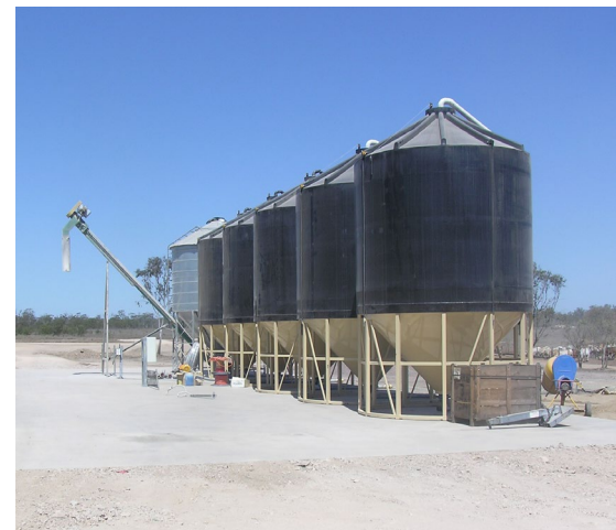
An arrangement of cone-bottom silos with a mobile auger for filling.

In general, grain in long term storage should be held cool and dry. Options include smooth wall steel silos, corrugated steel silos