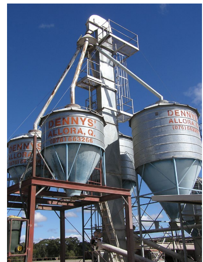
Bucket elevator, diverter and cone-bottom silos. The feed delivery vehicle is loaded directly from the elevated silos.