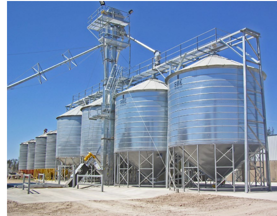
Receival grid, grain handling and cone-bottom silos. The grain is conveyed from the receival grid to a bucket elevator, with gravity fall to a horizontal conveyor for transport to the silo of choice. The height of the bucket elevator is reduced by using a horizontal silo loading conveyor.

Mobile augers, mobile belt conveyors, grain throwers and pneumatic conveyors may be used to load grain into storage facilities.