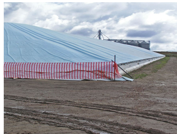
Temporary grain stockpile in a bunker storage with pre-fabricated steel sides.