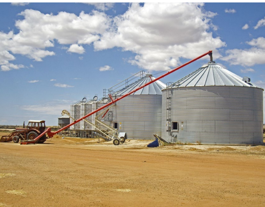
A tractor powered auger used for loading these flat-bottom silos. Note the PTO-powered auger at the base of the silo for unloading grain from the silo.

Mobile augers or belt conveyors, with fixed and guarded cross-sweeps, or a front-end loader can be used to empty the pad. Pneumatic conveyors also suit this job and allow easy final clean up of grain.