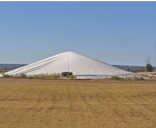
Covered grain stockpile in a bunker storage with small earthen walls.

Uncovered dumps are not advisable for storing grain for feeding to feedlot cattle.