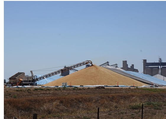
Ground dump being covered.

Grain bags must be installed on a well prepared site and away from bird habitats, including trees and water sources. Site preparation as outlined for pad storage should be followed. An elevated, well-drained pad provides optimal results – with no rocks that can tear the grain bags as they are being filled and unloaded.