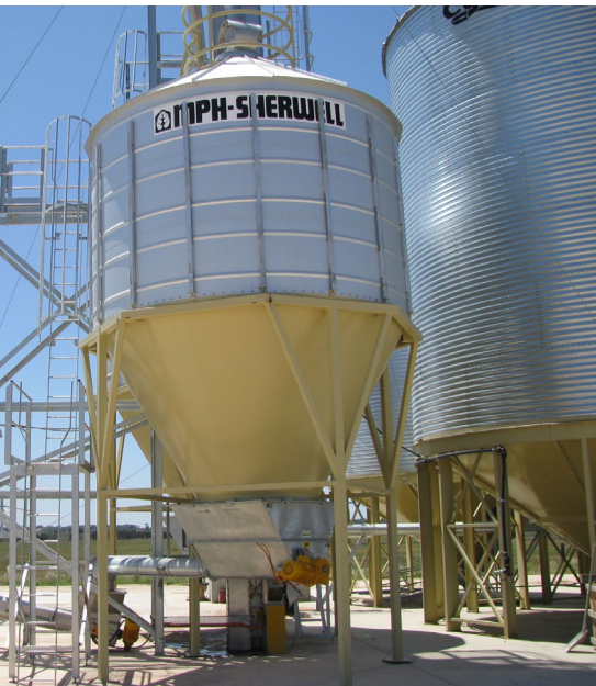
Live bottoms on cone-bottom silos provide a wider opening for handling products, such as moist grain, that tend to bridge.

bins, concrete silos and underground pits. Steel silos are the most common method of long term storage for grain at feedlots, but underground pit storage is an alternative for longer term storage.