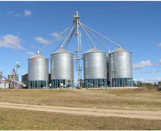
Gravity fall of grain through tubes from the bucket elevator to cone-bottom silos using a diverter. Greater height of bucket elevator is required for gravity fall of grain.