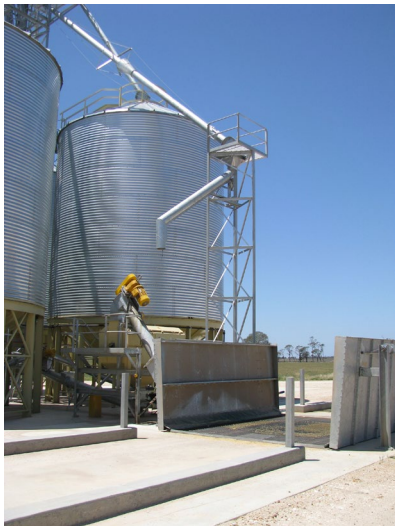
A drive-over receival grid with raised covering doors. A screw conveyor transfers grain from the hopper to a grain conditioner or scalper.