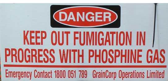
Safety warning – Fumigation with toxic gas.

Materials include woven polyethylene or PVC coated polyester. Woven polyethylene is cheaper, lighter, more easily handled and