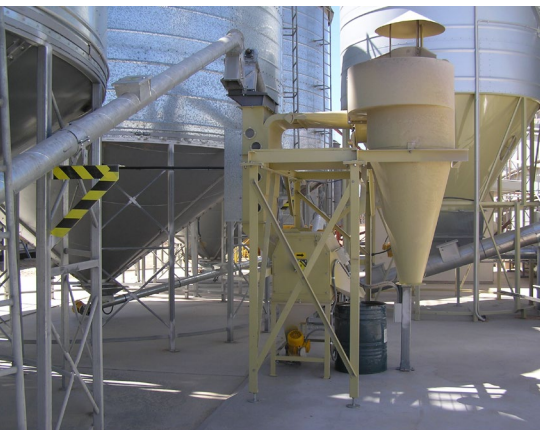
Grain scalper and cyclone to remove unwanted vegetable material and dust.

Animals should be kept away from storage bags using temporary fencing.