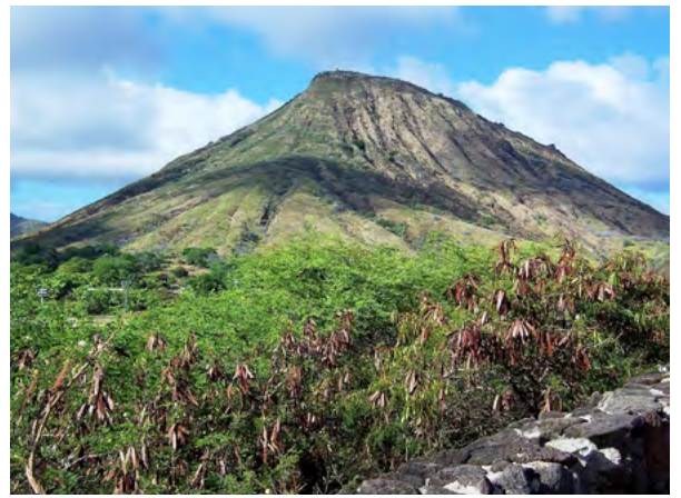
Leucaena is widespread on steep slopes in Hawaii.

on steep slopes, leucaena is a low priority for eradication or control.