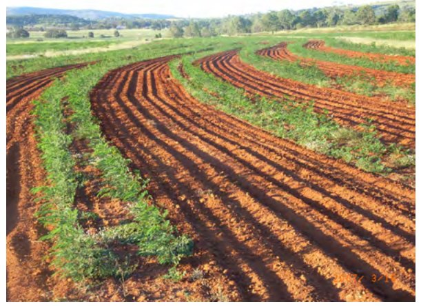
Contoured leucaena encourages water infiltration and decreases run-off.

Contoured hedgerows of leucaena have also reduced run-off and soil erosion in farming systems in Indonesia and the Philippines.