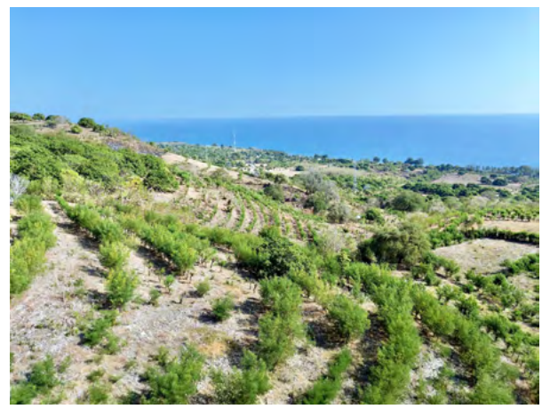
Contoured leucaena on sloping land reduces erosion in Indonesia.

Leucaena in catchments can mimic the water use of the original native woodland vegetation, thus preventing the development of dryland salinity by restricting deep drainage of excess rainfall. Whereas the roots of grass can extract water from the soil to a depth of 1.5–2m, leucaena roots can pull water from 3–5m, thus preventing rising water tables bringing salt to the soil surface.