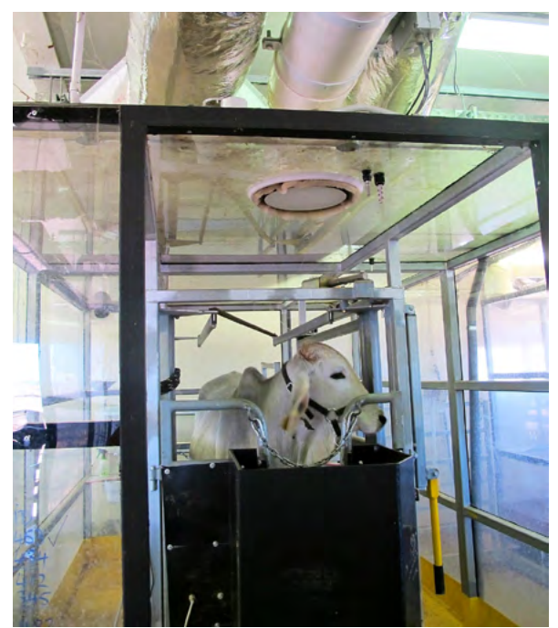
Measuring methane emitted from cattle fed leucaena-grass diets

These compounds include mimosine, flavanol glycosides and condensed tannins, and result in subtle, but significant, changes to the rumen microbial populations.