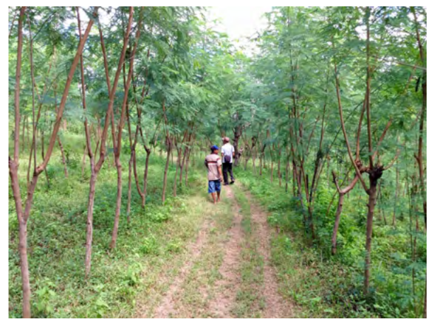
Leucaena being harvested for cattle fattening in Eastern Indonesia

They report that wider adoption of leucaena by local communities would discourage timber and forage cutting in conservation areas and reduce the pressure on existing forest resources.