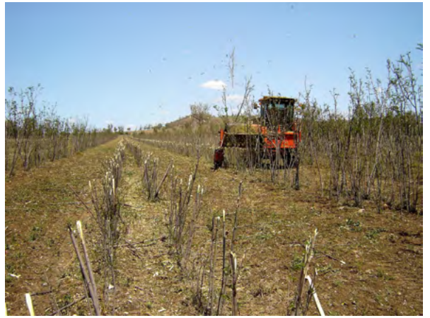
Mulcher used to control leucaena plant height and hence reduce seed production

Control of isolated or small patches of weed leucaena before they get the opportunity to spread and establish large and persistent seed banks is the best preventative strategy.