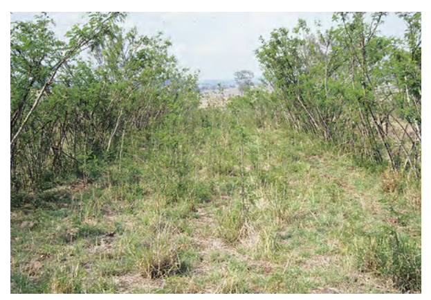
The Leucaena Network Code of Practice recommends maintaining a vigorous grass in the inter-row. This aims to prevent seedlings establishing and thickening.