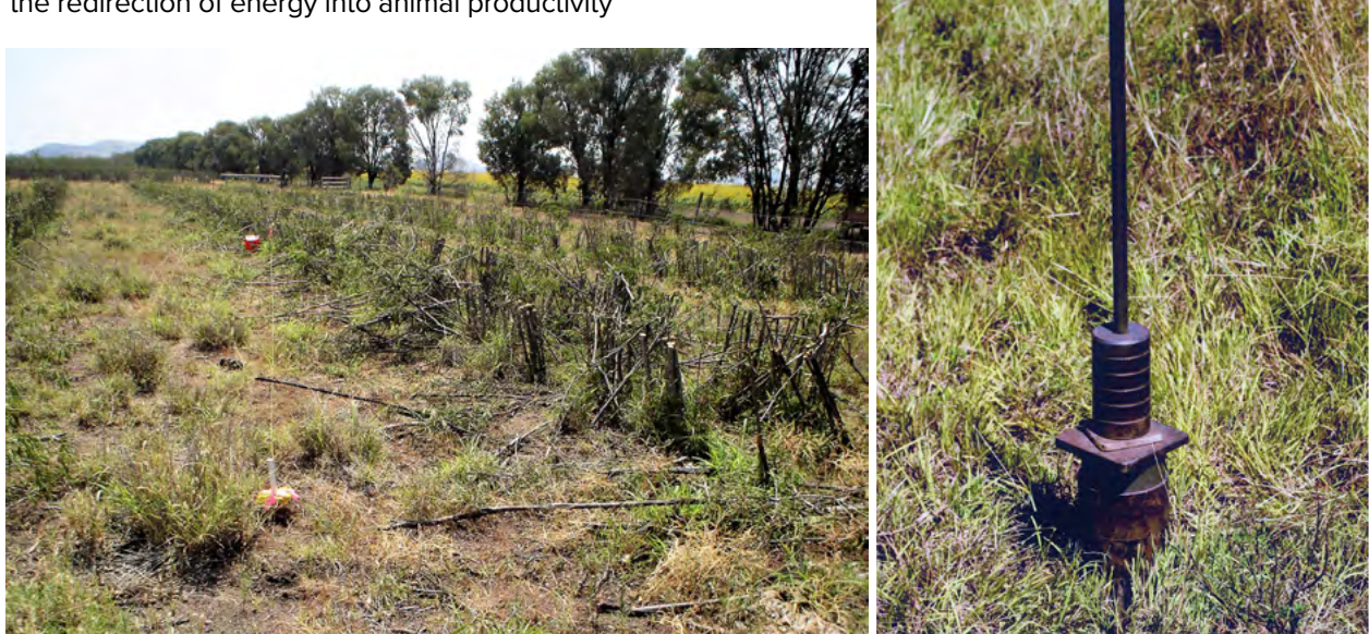
Soil sampling has shown significant increases in soil carbon in grazed leucaena-grass pastures

Modelling of leucaena-based production systems can provide estimates of the impacts on farm profitability of improved live weight gain, increased soil carbon storage, methane emission reduction and higher urinary nitrogen concentration.