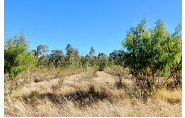
Leucaena that has escaped from the paddock onto the roadside

However, leucaena has not been an explosive weed compared to the millions of hectares of weeds such as prickly acacia, rubber vine or lantana.