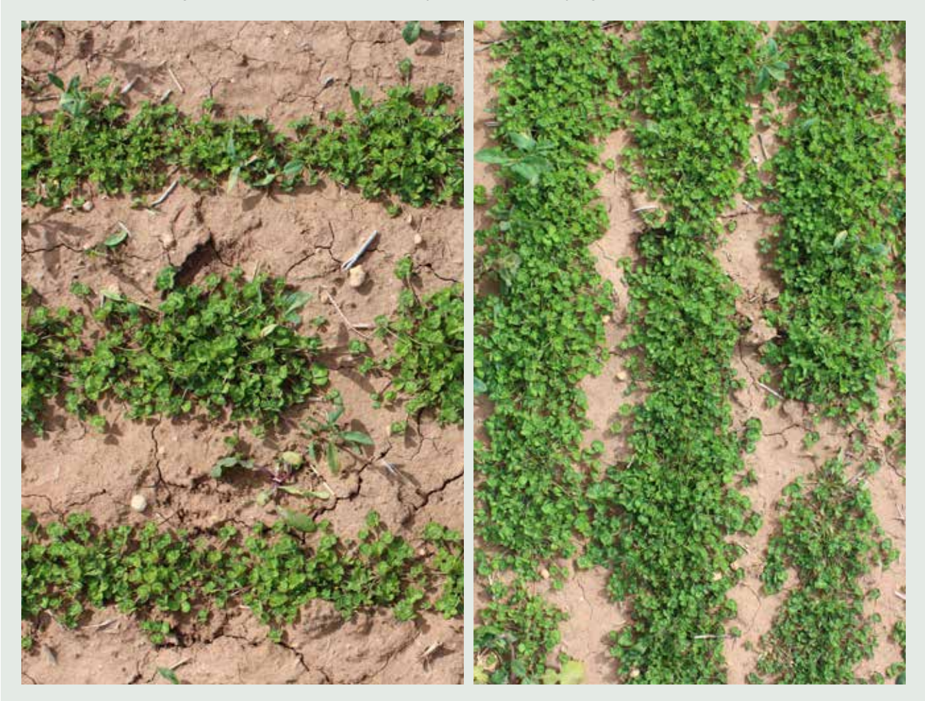
Two different registered 'clover-safe' broadleaf herbicides showing more suppression on Seaton Park sub-clover on left (active ingredient 2,4-D amine) than on right (2,4-DB) at label rates.

Some level of damage to the desirable species may occur from applying selective herbicides.