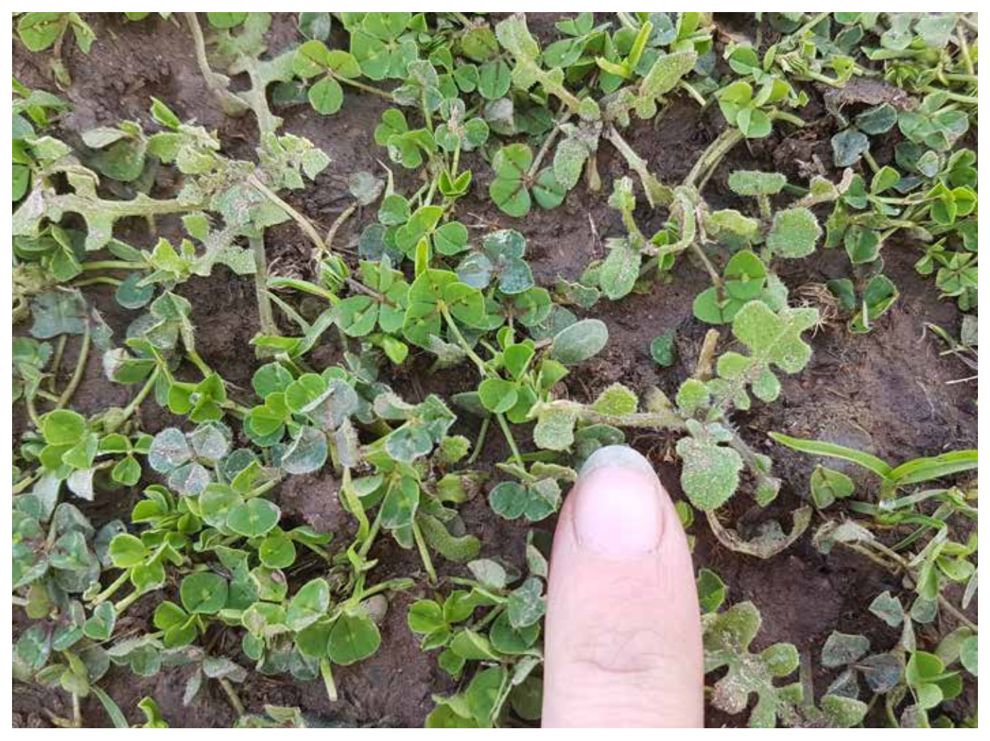
Use selective herbicides on small weeds but not until sub-clover has grown three trifoliate leaves.

Selective herbicides should be used strategically and full benefit is only achieved if subsequent pasture competition can be achieved. The aim should be to remove the weed for a sufficient period to allow the more desirable species to grow into their place and compete. Changes to soil fertility, species and grazing method (such as grazing and spelling) may be required to enhance the long-term effect of the herbicide.