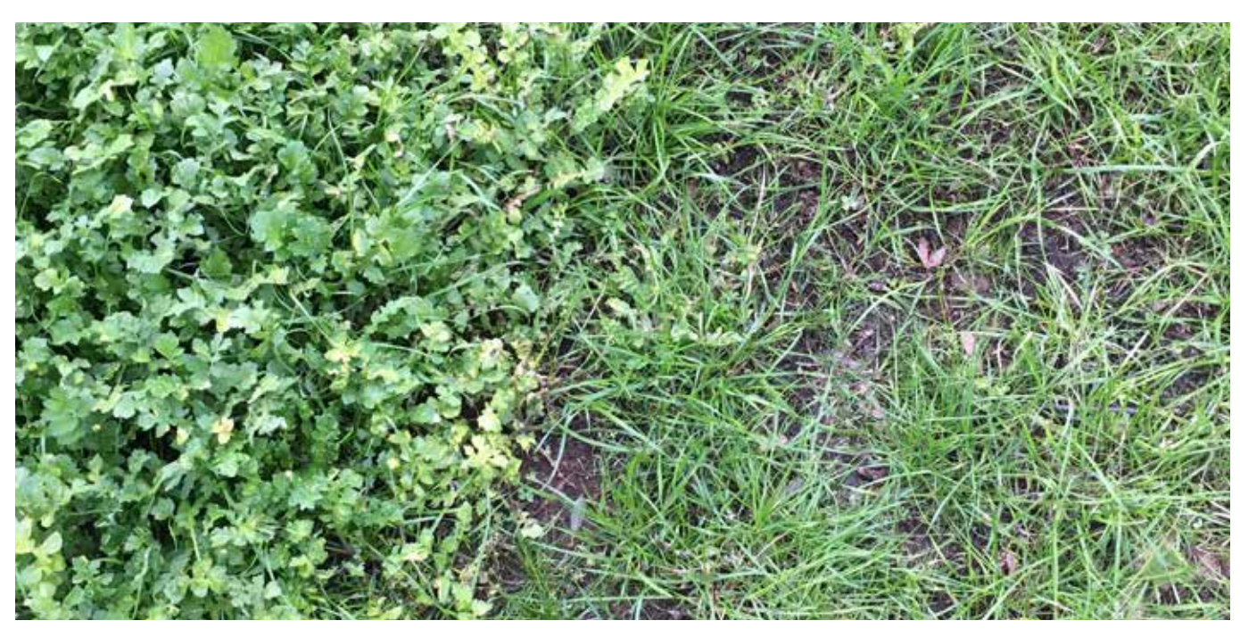
Removal of capeweed using broadleaf selective herbicide.

The success of selective herbicides depends on their ability to kill the target weeds such as barley grass, silver grass, soft brome grass, capeweed, thistles and erodium, while minimising damage to desirable species, such as phalaris, perennial ryegrass, cocksfoot, tall fescue and sub-clover.