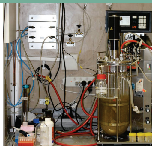
The Fermentor

Preliminary data from in vitro fermentor runs indicated that the freshwater algae, spirulina, did not affect methane emissions. Experiments were conducted to test the effectiveness of the marine algal product Algamac 3050, to deliver three, five and seven per cent oil content to the diet.