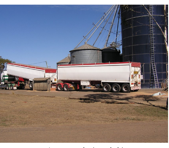
A permanently situated, drive-over grain receival hopper for fast unloading of trucks.