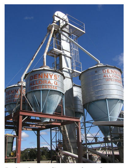
Bucket elevator, diverter and cone-bottom silos. The feed delivery vehicle is loaded directly from the elevated silos.