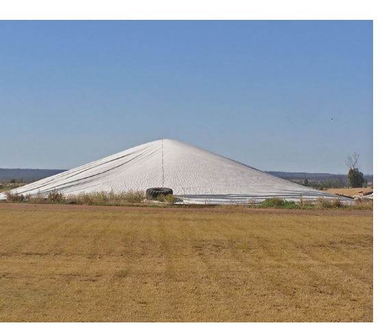
Covered grain stockpile in a bunker storage with small earthen walls.