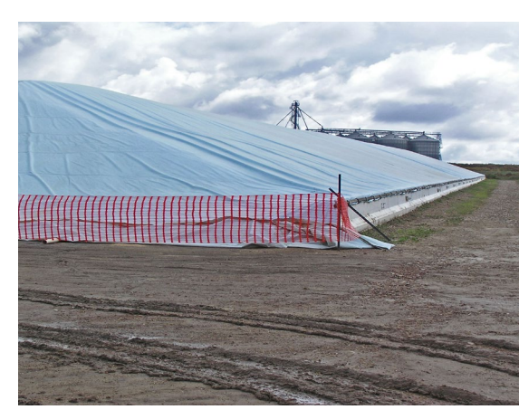
Temporary grain stockpile in a bunker storage with pre-fabricated steel sides.