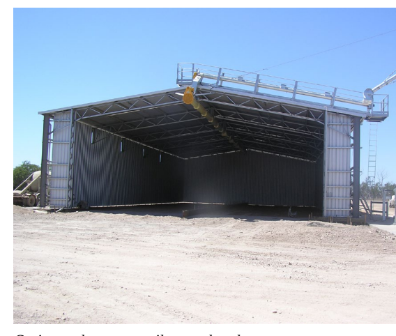
Grain can be temporarily stored under cover. This grain storage shed has a permanently mounted central discharge auger for loading the shed.