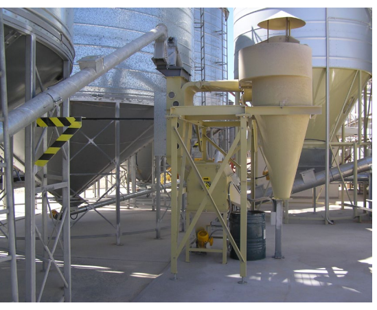
Grain scalper and cyclone to remove unwanted vegetable material and dust.

Animals should be kept away from storage bags using temporary fencing.