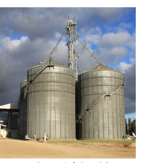
Large-capacity flat-bottomed silos. Note safety handrails are included on the walkway.