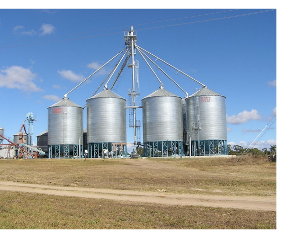
Gravity fall of grain through tubes from the bucket elevator to cone-bottom silos using a diverter. Greater height of bucket elevator is required for gravity fall of grain.