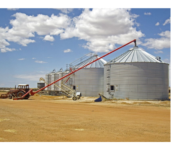
A tractor powered auger used for loading these flat-bottom silos. Note the PTOpowered auger at the base of the silo for unloading grain from the silo.

Mobile augers or belt conveyors, with fixed and guarded crosssweeps, or a front-end loader can be used to empty the pad. Pneumatic conveyors also suit this job and allow easy final clean up of grain.