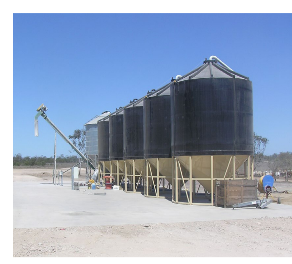
An arrangement of cone-bottom silos with a mobile auger for filling.

In general, grain in long term storage should be held cool and dry. Options include smooth wall steel silos, corrugated steel silos