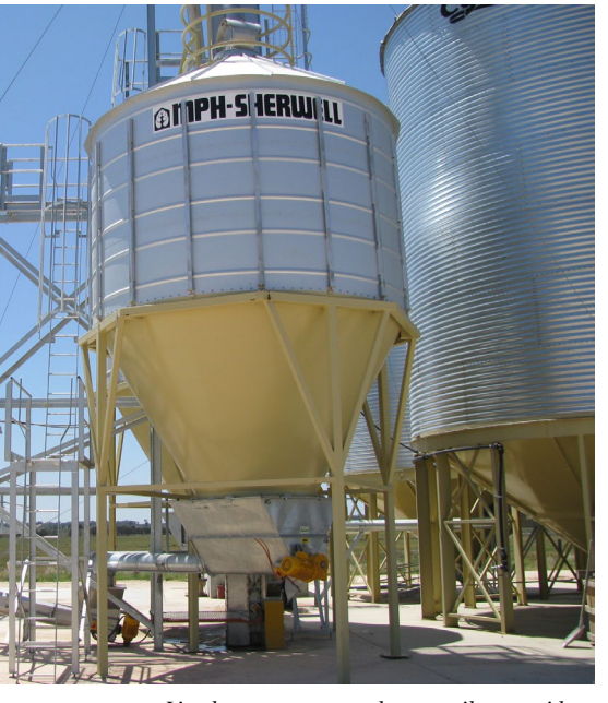
Live bottoms on cone-bottom silos provide a wider opening for handling products, such as moist grain, that tend to bridge.

bins, concrete silos and underground pits. Steel silos are the most common method of long term storage for grain at feedlots, but underground pit storage is an alternative for longer term storage.