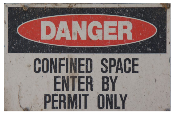
Safety - confined space warning on silo.

Quality can deteriorate rapidly in uncovered grain piles. Grain temperature and moisture content should be checked at several locations every two or three weeks.