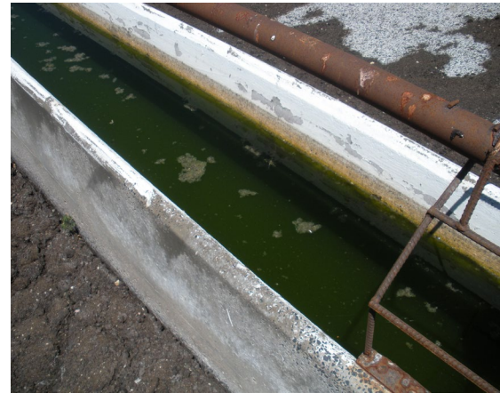
Dirty water troughs can transmit some cattle diseases.

Water troughs should be cleaned on a regular basis to prevent algae buildup. Covers or chlorination can prevent algal blooms in temporary water storages.