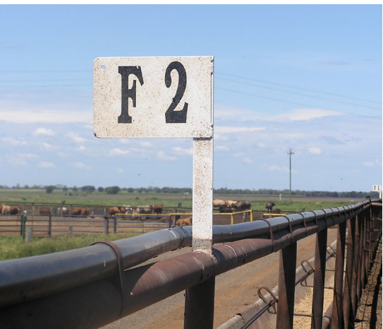
Drinking water can become extremely hot if steel or plastic water pipes are exposed to solar radiation.

Surface water sources can become stagnant during extended periods of dry weather, drought or low flow. Nutrient enrichment and higher water temperatures can generate algal blooms that may contain blue-green algae (cyanobacteria). Livestock have become sick or died from drinking water containing toxins (microcystins) released by blue-green algae.