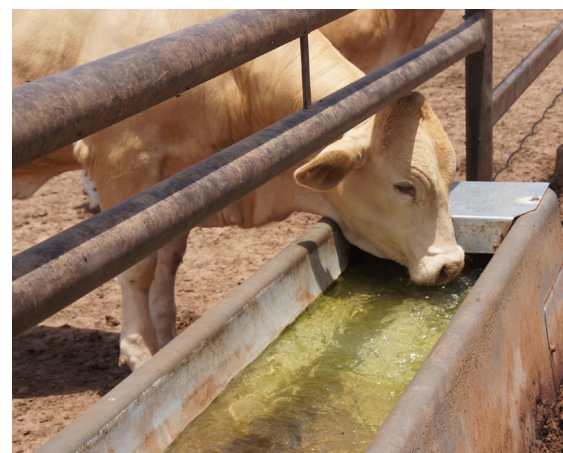
Cattle drinking from trough with algal growth.