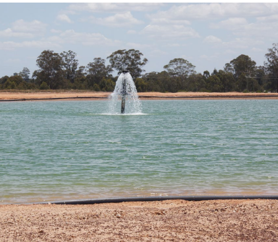
Fountains help aerate and cool artesian water and/or storage water during hot weather.