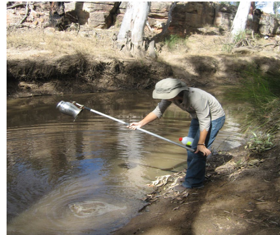
Water quality should be assessed by collection and analysis of water samples.

Bacteria, viruses, parasites and algae can be found in water sources. While most microorganisms are harmless some, such as blue-green algae, can affect livestock health and reduce performance. A contaminated water source can spread a pathogen (disease-causing agent) quickly throughout the feedlot; for example, leptospirosis can be spread through water supplies.