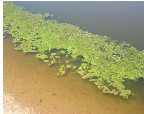
Algal growth in stagnant water. Some types of algae (e.g. blue-green algae) produce mycotoxins which are toxic to livestock.