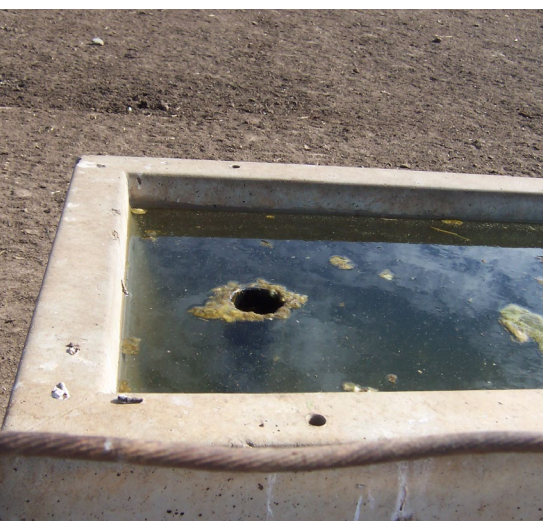
Dirty drinking water can reduce animal performance.

A variety of microbial pathogens such as bacteria, viruses, protozoa and parasites can be transmitted to livestock from drinking water sources. The risk of contamination is greatest in surface waters that are directly accessible by livestock or that receive runoff or drainage from a manure source. Groundwater contamination by pathogens has generally been considered to be low.