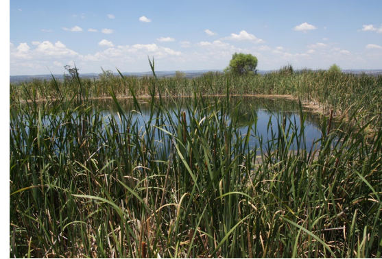
Reeds around water storages may adversely affect water quality.

Sulphate is present in most water sources and is commonly found in the form of calcium, iron, sodium, and magnesium salts, all of which act as laxatives. Elevated levels of these salts can make the water taste objectionable to cattle.