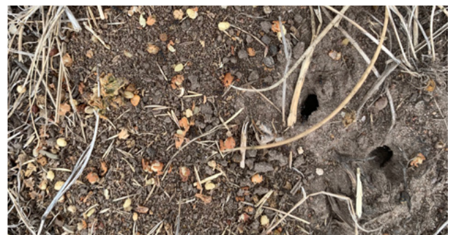
Ant predation of surface seed by stripping seed from burr to take down into nests.

Choosing cultivars that best suit the soil type, grazing approach and time of flowering to match growing season length is critical to the long-term success of a sub-clover pasture. 3