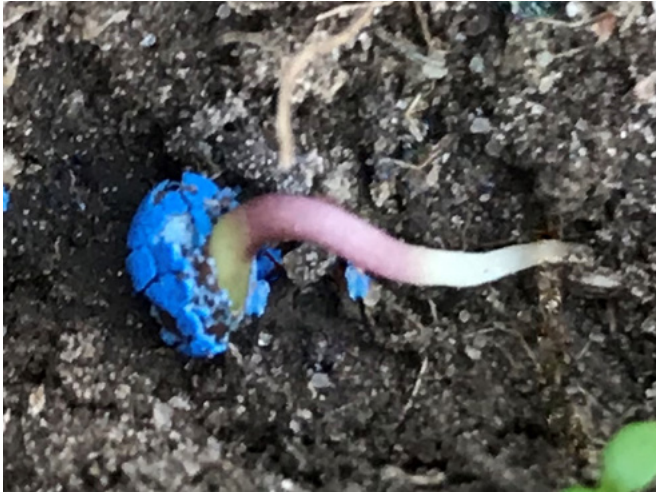
New root emerging from germinating sub-clover seed (blue coating is seed treatment).

Seed germination occurs once hardseededness has broken down, soil temperature is below 26°C and cumulative rainfall events are above 20mm. The dry seed absorbs moisture, initially producing a root called a radicle.