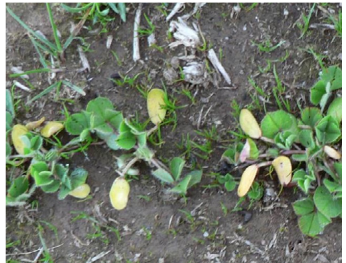
Sub-clover showing cotyledons dying 6–8 weeks after germination.

The seedling becomes less vulnerable to grazing after the appearance of the spade leaves because the seed stem (hypocotyl) is drawn below the soil surface, forming a tap root and anchoring the plant more securely. The growing point also retracts below grazing height.