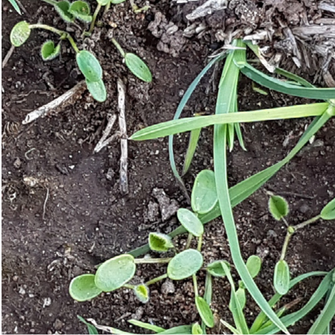
Germination of three cotyledons per palm size (8x8cm) is required to achieve at least 40% sub-clover in a pasture.

Being an annual, sub-clover needs to germinate and re-establish each year to contribute to the pasture mix. A pasture with adequate sub-clover relies on the successful germination of 20–30kg/ha of seed (30–45 plants in 0.1m 2 ). This will result in a pasture with at least 40% sub-clover content by late winter.