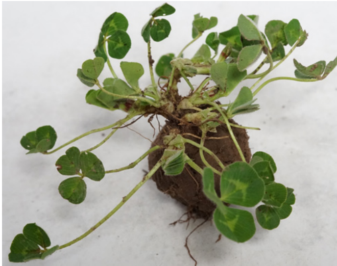
Sub-clover rosette, 15cm in diameter, with six branches and many leaves visible.

Sub-clover grows from a central point, producing branches that commonly grow horizontal to the ground. Along each branch, between 8–16 leaves are produced, which gives the plants a rosette appearance.