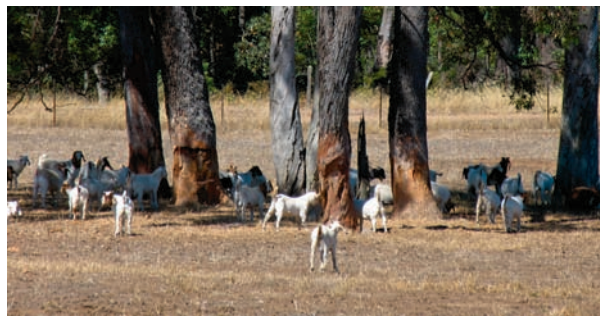
Under some circumstances goats have the potential to ringbark trees. Corrective action should be taken such as fencing off at-risk trees as soon as such activity is observed.

Remember that you are part of a broader industry and your actions reflect on the image of the goat industry as a whole.