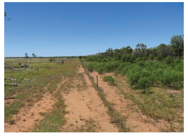
Managed correctly, goats can be a cost-effective tool in managing regrowth. The regrowth to the left of the fence in this photo was controlled using goats, whereas the area to the right of the fence has been left unmanaged.

Be aware of the potential impacts that your enterprise may have on the environment. Some areas of land are fragile and are not suitable for a grazing enterprise, or require very careful management to prevent further damage. The sorts of things that you need to consider are erosion risks, salinity problems and threatened native vegetation. Well managed goats are kind to the land. However, managed irresponsibly, goats have the potential to degrade land quicker than sheep or cattle.