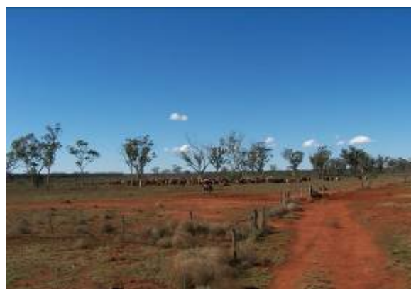
Figure 18 and 19 – Billy Goat paddock 2005