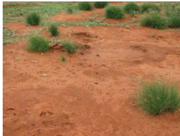
Figure 8 and 9. Goat paddock at 'Arakoola' prior to PDS project, dominated by Greybeard