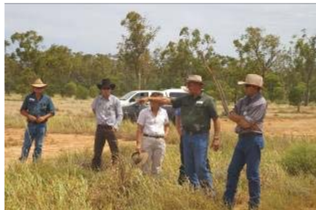
Figure 22 & 23 – Field day 'Bindebango' (left) and 'Arakoola' (right) March 2009.