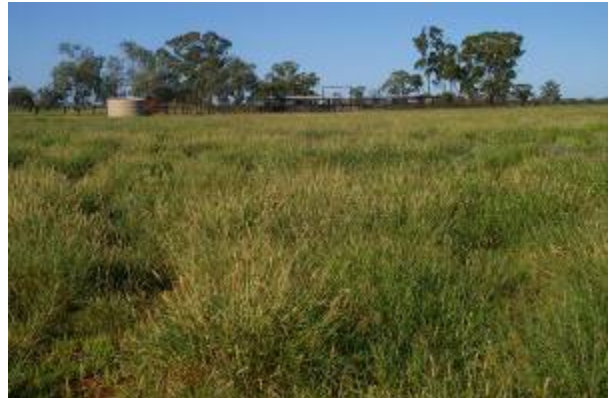
Figure 20 (left) Billy goat paddock winter 2007. Figure 21 (right) March 2010

At the end of the project the Winks family described the benefits of "effective" rainfall spelling to their business;