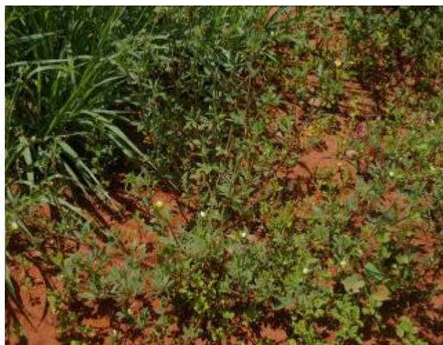
Figure 16 & 17– Goat Paddock, 'Arakoola', February 2010.