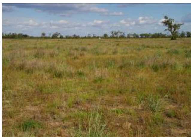
Figure 10 & 11 – Proposal paddock, 'Yendon' November 2010. Bambatsi, Floren Bluegrass and curly Mitchell grass.