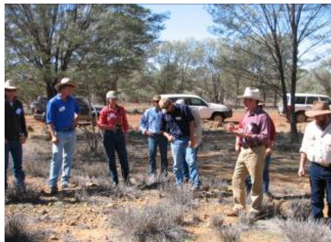
Figure 1 and 2. Planning session and field session at Bollon GLM workshop August 2006