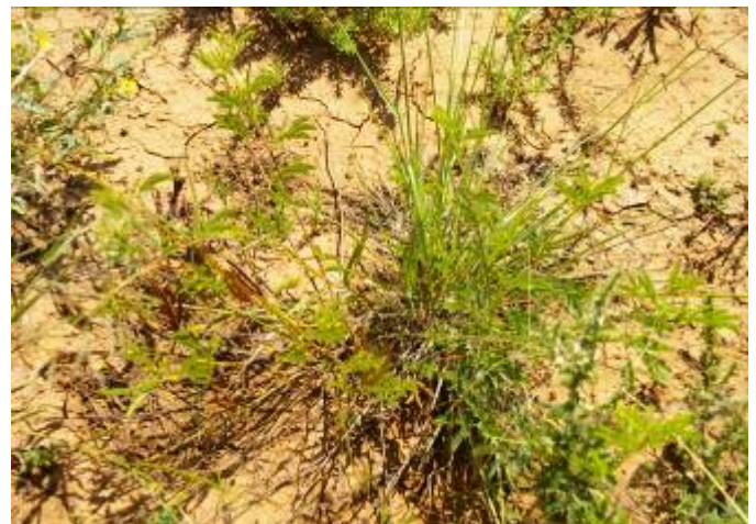
Figure 14 & 15 – GLM Paddock, 'Bindebango'. Left landscape photo. Right, trayback photo ( Desmanthus ). Nov 2010