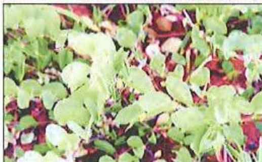
Wynn Cassia established very well on the red soils at Arakoola.