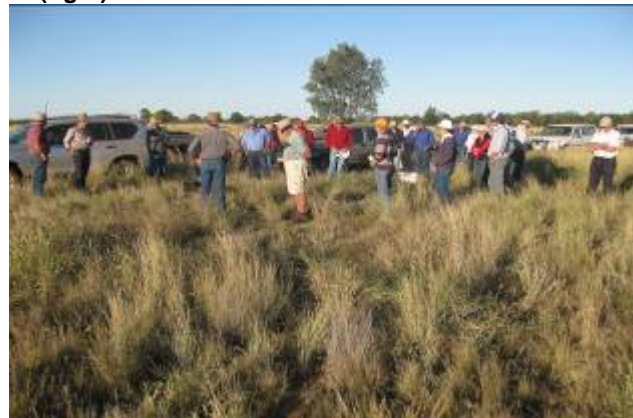
Figure 24 & 25 - Field day photos 'Woolerina', May 2010