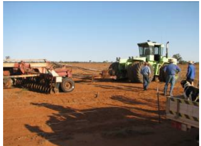
Figure 4 and 5. Paddocks at 'Yendon' and 'Woolerina'

The Horse paddock at 'Woolerina' (poplar box and pine on deep sands) was allocated as a sown pasture demonstration paddock and was also in C condition. Preparations for the sown pasture included stick-raking and cultivation. Seed was manually spread following cultivation on the 11 September (after 23 mm of rain on 31 August and 26 mm on the 5 September). Table 2 lists the pasture species mix. Both paddocks at 'Yendon' and 'Woolerina' required fencing and water points prior to planting.