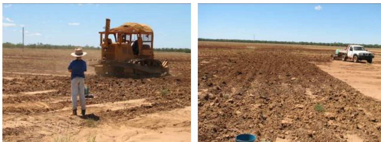
Figure 6 and 7. GLM paddock at 'Bindebango' being prepared and saltbush planted

At commencement of the PDS project this paddock had very little vegetation, most of which were annuals and weeds. The Blaydens fenced and deep-ripped during February and March 2008 in readiness for planting (Figure 6). In March, Eyre-Gray saltbush seedlings were hand planted and watered into strips within the trial area (figure 7). Due to prevailing dry conditions after planting, the surviving saltbush seedlings were transplanted into the house yard where they could be more easily watered. The surviving saltbushes were transplanted back into the GLM paddock on 24 October 2008. The GLM paddock was again deep ripped and sown with grass, legume mix (listed in table 3) on the 15 September 2008 after 50 mm of rain in early September.