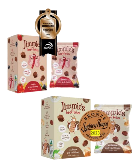
Fig.9 Two new medals for the Jimmie's Beef Bites range

Two of our Jimmie's launch flavours – Mushroom and Cauliflower, and Tomato, Olive and Cheese – were successful in receiving medals in September 2023 in the Sydney Royal Fine Food Awards and Australian Charcuterie Excellence Awards, respectively; as shown in Figure 9.