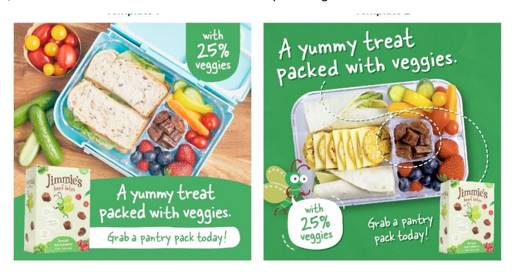
Fig. 11 'Hidden veggies' marketing content

These findings were carried forward into an online advertising and social media campaign, a sample of which is shown in Fig. 11 below. The content created for this campaign directly targeted the archetypical consumer for the Jimmie's brand – women aged 30-50 with primary school aged children, who value convenience and nutrition when providing snacks for their kids.