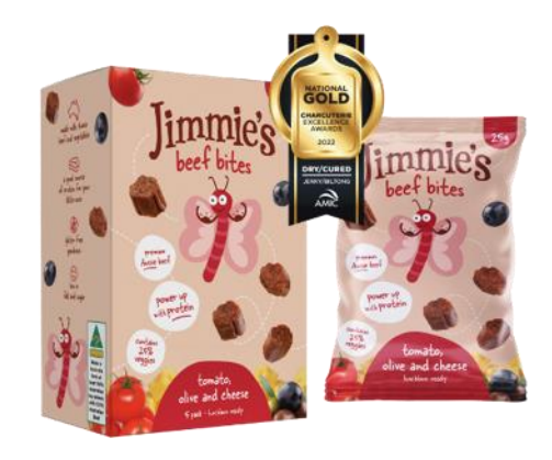
Fig. 5 Pack mock-ups shown with medal overlays on the Jimmie's Shopify (D2C) e-commerce platform

In addition, experiments in unpaid media placements were conducted, including coverage from ABC News (as shown in Fig. 6) and social media via emerging influencer relationships.