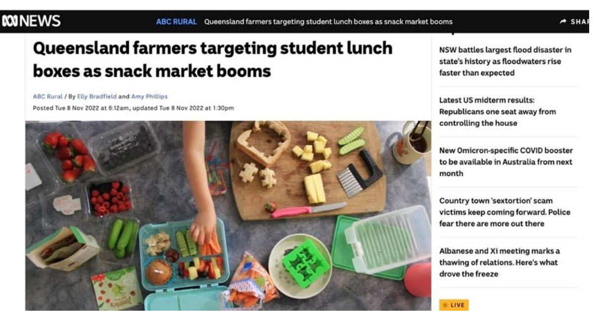
Fig. 6 ABC Media coverage of the Jimmie's offer and beef snack trends