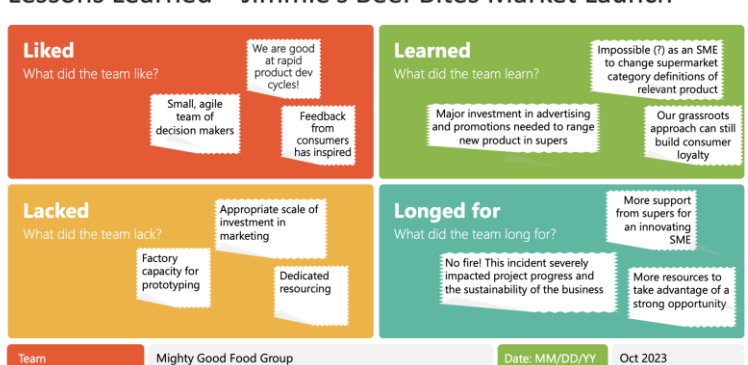
Lessons Learned – Jimmie's Beef Bites Market Launch

The team undertook several Lessons Learned (After Action Review) sessions to identify the major learnings from a market-launch project for a new category of product. The summary findings are shown in Fig. 17 below.