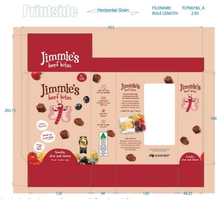
Fig. 8 Final print-ready artwork for Jimmie's