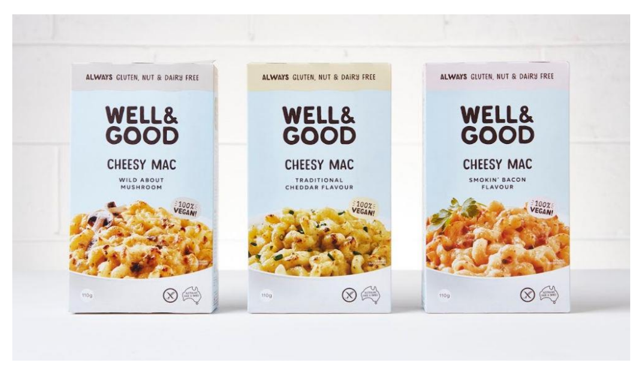
Fig. 7 Health focused, kid-oriented products are increasingly sitting outside the health star rating system