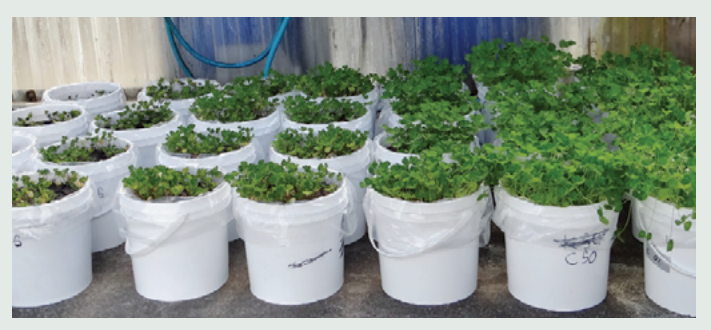
Response of subterranean clover to increasing rates of P (0–100% of estimated P required for maximum growth)

The combination of set stocking and high stocking rates can lead to an increase in sub-clover content, which can also improve performance per head. In contrast, rotational grazing usually leads to an increase in the grass component, which increases production per hectare.