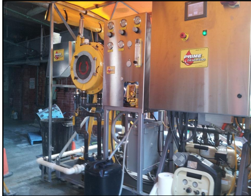
Figure 4: RFP Pilot Plant

A close-up of the press chamber is shown in Figure 5. The two stainless steel wedge-wire screens rotate at a maximum speed of 1 rpm and there are no bearings in the dewatering channel. The sludge enters at the bottom of press and the filtrate is extruded through the screens and discharges from each side of the press. There is a gradual increase in compaction as the sludge moves through the press and it is discharged at the top of the press.