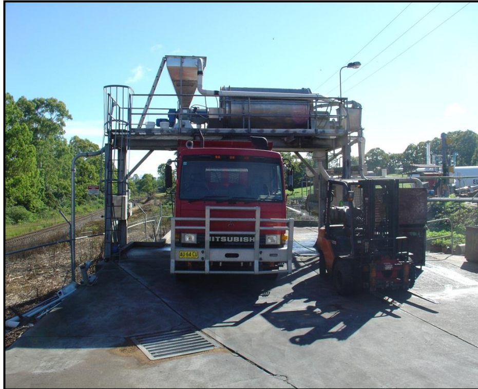
Figure 2: PW Dewatering System (Screw press)

Due to the relatively poor solids capture obtained with the screw press the filtrate is screened using static inclined screens to capture additional solids. A picture of one of the two screens is shown in Figure 3.