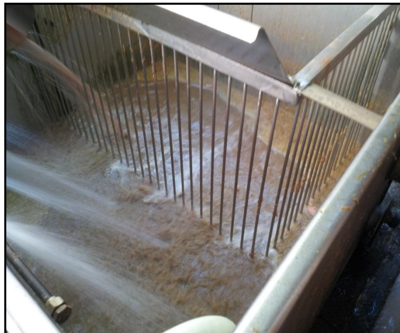
Figure 1: PW Tank at the trial site

As illustrated in Figure 1, this PW feed bin is well mixed by the constant feed of material and some spray water. It was decided to feed the RFP pilot plant from this PW bin. A 50 mm nipple was attached to the drain line of the bin and the suction side of the RFP feed pump was attached to this connection. Currently PW from the feed bin is pumped to the existing FAN screw press for commercial dewatering. A picture of the current FAN screw press is shown in Figure 2. The dewatered cake drops directly into a truck for off-site disposal.