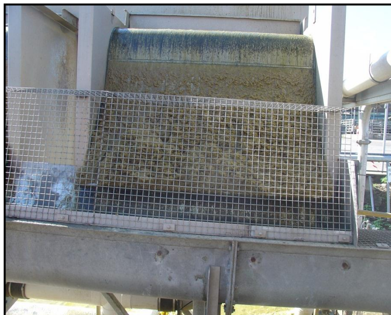
Figure 3: PW Filtrate Screening System

The AIM Water RFP pilot plant is Model RFP-18S dewatering unit, with a nominal hydraulic capacity of 1.5 m 3 /h. The pilot plant is an integrated dewatering system comprising a positive displacement feed pump, an in-line polymer feed and flocculation system, the RFP and a Programmable Logic Controller (PLC) for automated operation of the press. The entire system is trailer-mounted and a picture of the pilot plant is