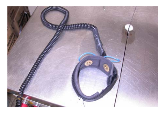
Fig. 1: The sensing system

The Bladestop system has three integral components; the sensing systems (see Fig. 1), the firing and mechanical mechanism (see Fig. 2) and the operating smarts.