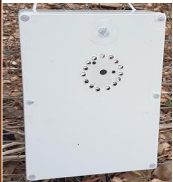
Custom-designed Electronic Components: