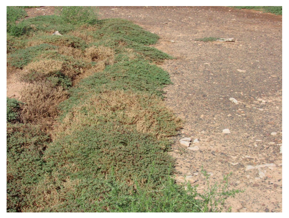
Photo F: Soil on the left covered in pigweed has been ripped and bare soil on the right was left undisturbed. Due to a lack of soil moisture there was no plant growth on the right