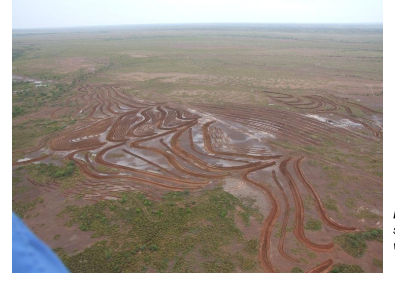
Photo A: Aerial view of the Larrawa station regeneration site, covered in open water ponds.