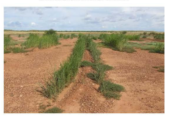
Photo B Annual forage sorghum growing in furrows created by agro-plough.