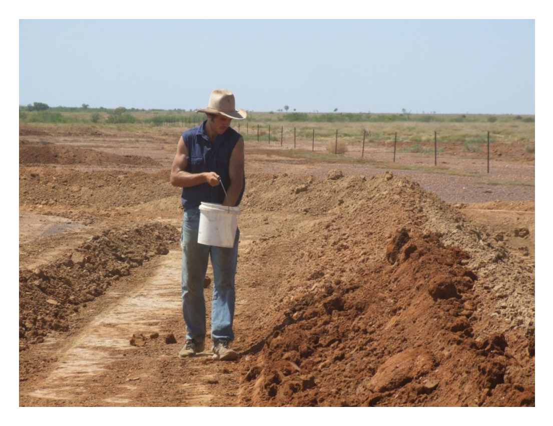
Photo B: Casting forage sorghum on inside of bank to ensure germinable seed is present

No data (engine hours or fuel consumption) was recorded on the cost to build closed ponds due to the small number of closed ponds built (x4). This was due to the slope of the land within the demonstration area being > 0.4% (40 cm in 100 m). Ideally closed ponds are built on land with a slope < 0.3% (3 cm in 100 m).