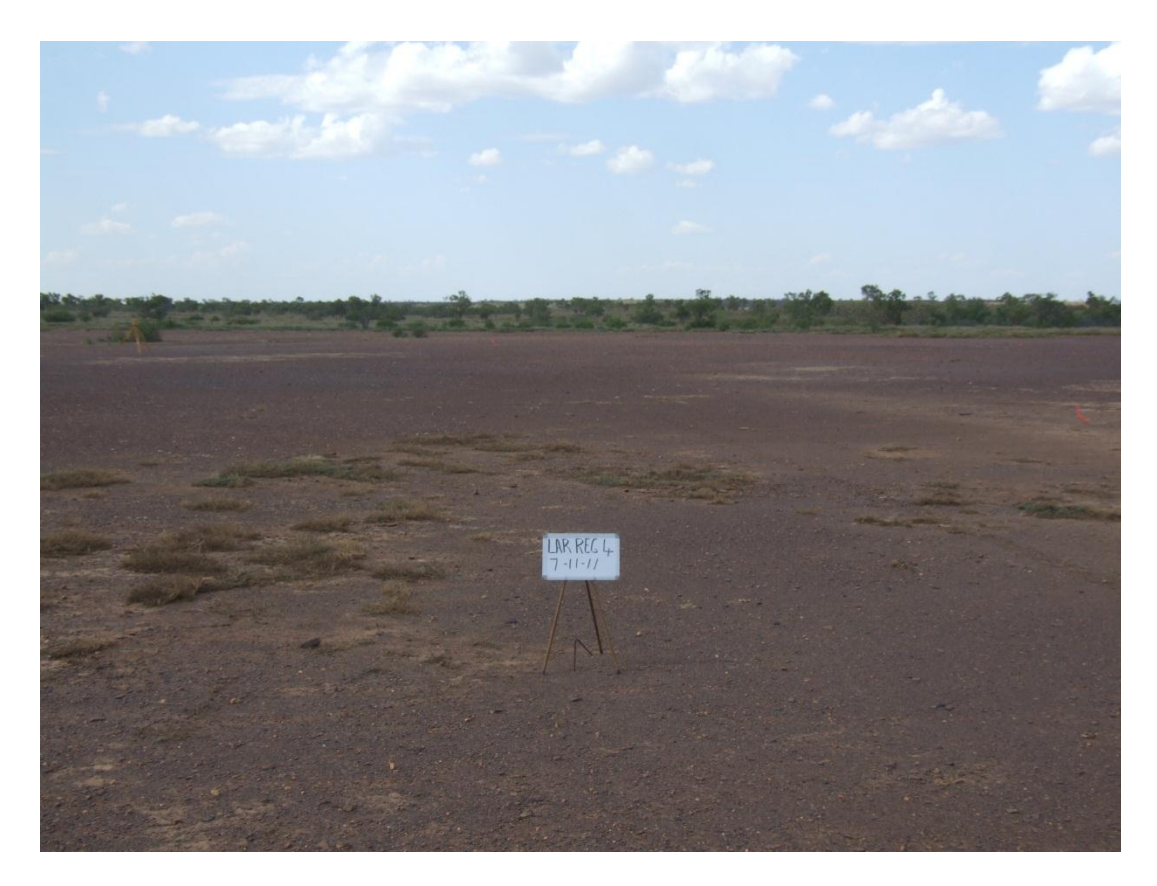
Photo C: Larrawa station regeneration monitoring site no.4 November 2011 (pre works)