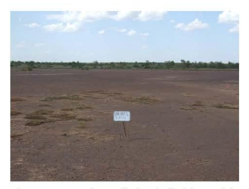
Larrawa regeneration monitoring site No.4 (pre-works) – photo taken 7 November 2011.

The PDS on Larrawa station is jointly funded by Meat and Livestock Australia, Rangelands NRM and the Department of Agriculture and Food. A field day at Larrawa station is planned for early 2012.