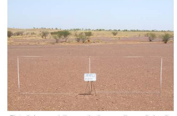
Photo A Larrawa station rangeland regeneration monitoring site at start of project in November 2009.

[Email matthew.fletcher@agric.wa.gov.au for a copy.]