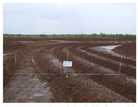
Larrawa regeneration monitoring site No.4 (post-works) – photo taken 10 November 2011.