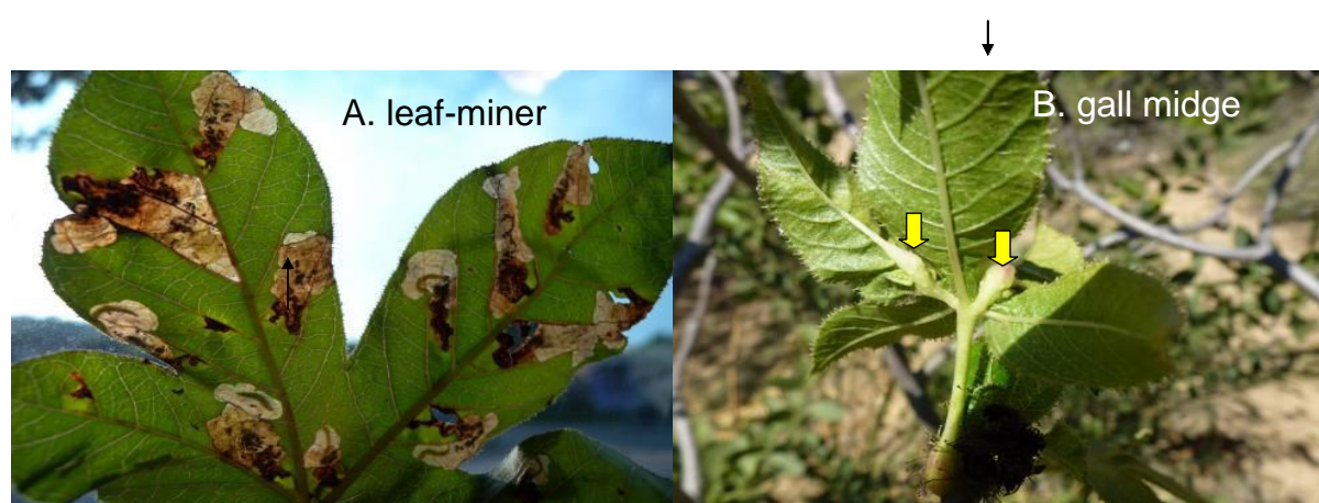
Figure 2. Damage by the leaf-miner (A) Peru and the gall-midge (B) in Bolivia.