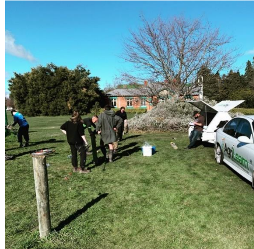
Figure 8. AgriLearn teaching and assessing students with agricultural skills at Mt Hutt, New Zealand (Peltzer, 2019).

Another transferable concept is AgriLearn, an independent business in Timaru, New Zealand, that works with secondary schools to deliver skills-based training to complement the practical portion of their agricultural education. For example, Fiona Jessep of Mount Hutt College, uses AgriLearn to teach and assess her students with their fencing skills for their