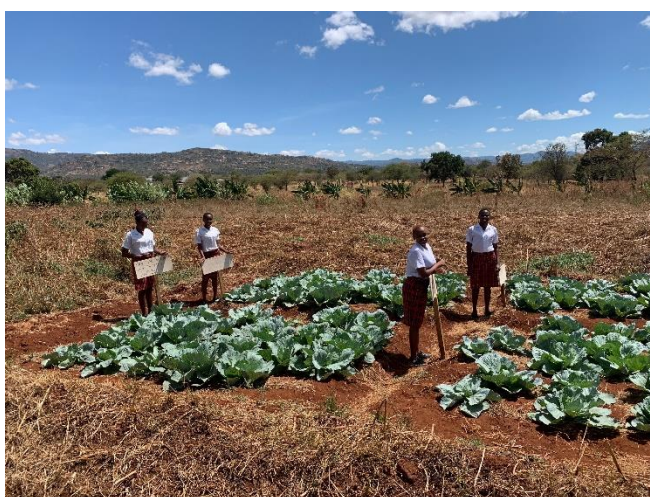
Figure 3. Kenyan students studying agriculture at secondary school (Peltzer, 2019).

Having visited 16 countries in 2019 alone, it is difficult to pinpoint the exact reason why youth are not choosing a career in agriculture. For example, Ireland have strong numbers studying a university degree in agriculture but have limited numbers of youth interested in farming. On a similar note, Kenya has a high proportion of well-educated youth studying a degree in agriculture; however, they are limited by the job opportunities available post-university (Figure 3). The analogy given was “too many pilots, not enough planes” (Barden, 2019). Alternatively, Australia is limited in overall graduate numbers which has led to an excess of graduate positions not being filled (Pratley & Archer, 2017).