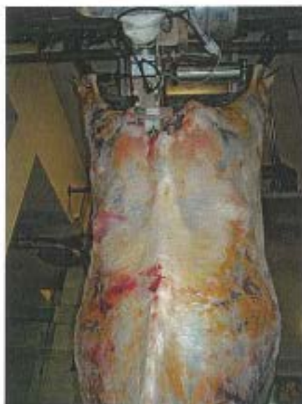
Figure 1: Tailbone to One Side