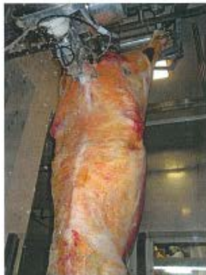
Figure 3: Guide Roller at the Start Position