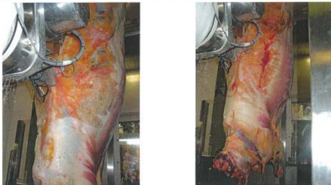
Figure 4: Roller Guiding During the Cutting Process

As seen in figure 4 the distance between the roller and the saw blade is too great. This distance needs to be reduced for the roller to sense the position of the carcass prior to the saw blade.