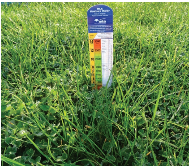
Compromised grazing height to suit both sub-clover and perennial grasses.

Intensive grazing does not need to be repeated each year, as the seed bank can build rapidly in a single season. Continual intensive grazing may also encourage the growth of broadleaf weeds such as capeweed and erodium. These weeds can be successfully controlled using spray grazing.