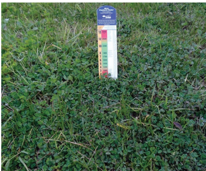
Grazing height to favour sub-clover over perennial grasses.

If more sub-clover is desired, grazing frequently and to 1,000kg DM/ha is necessary.