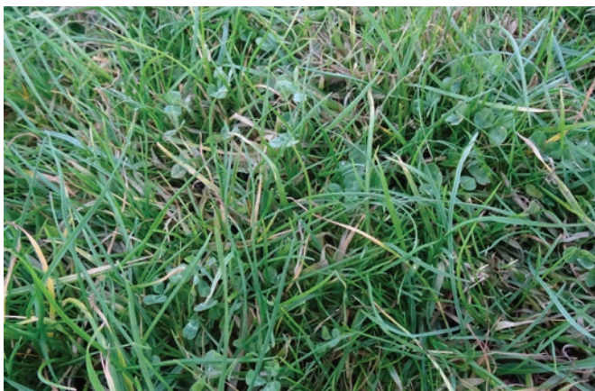
Lax grazing leads to sub-clover becoming shaded by grasses and reduced leaf initiation.

Maximum sub-clover leaf production is achieved by frequent heavy grazing, rather than light grazing and long periods of spelling. Sunlight reaching the crown of the sub-clover plant stimulates leaf production and shading reduces leaf production.