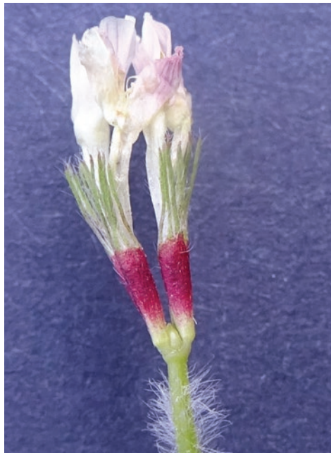
Sub-clover flowers on cultivar Mt Barker showing red pigment on the flower tube.

Sub-clover flowers are easy to observe. They are usually white and have three or four tubular florets. Different cultivars can have different markings, such as red pigmentation.