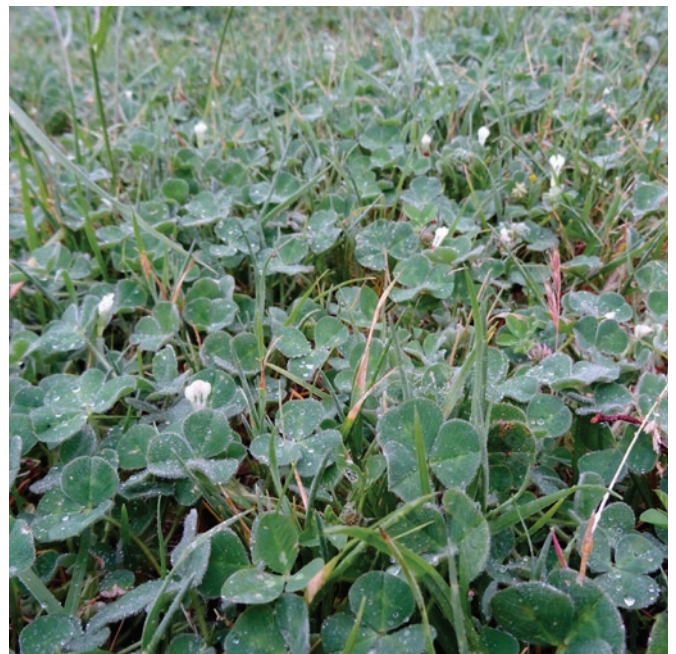
White flowers visible on sub-clover in a pasture.

Regular inspections should be made for pests, especially redlegged earth mites which can damage the flowers without necessarily appearing to do damage to the leaves.