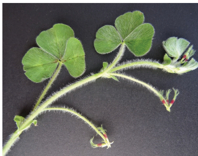
A sub-clover runner with the newest leaf emerging from the end of the runner and flowers at the stem intersection of each leaf.

Flowers and leaves grow from the same position on the runner. The flowers along each runner will be at different stages of maturity, with the oldest flower closest to the crown of the plant and the newest flower at the end of the runner.