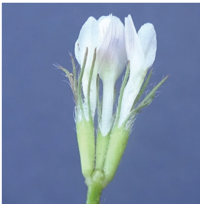
Sub-clover flowers on cultivar Riverina with a green flower tube.