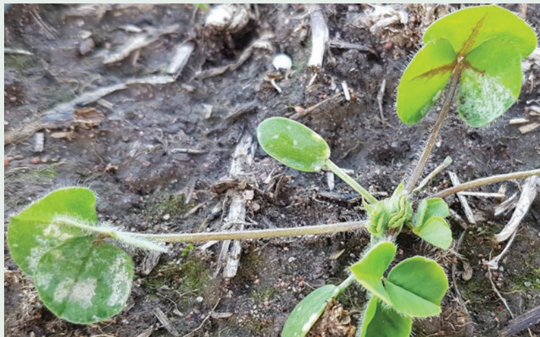
Redlegged earth mite damage on sub-clover seedlings.

Regular inspections should be made for pests, especially redlegged earth mite (RLEM) which hatch when there has been at least 25mm rainfall and average daily temperatures fall below 21°C.