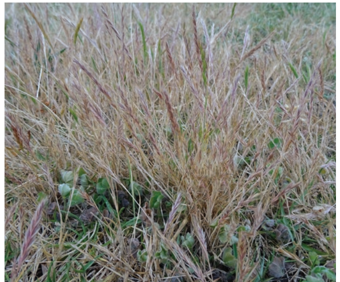
Dry silver grass will release a natural toxin that reduces the germination of sub-clover.

A compromise between protecting the soil, achieving hard seed breakdown and reducing the toxic effects is