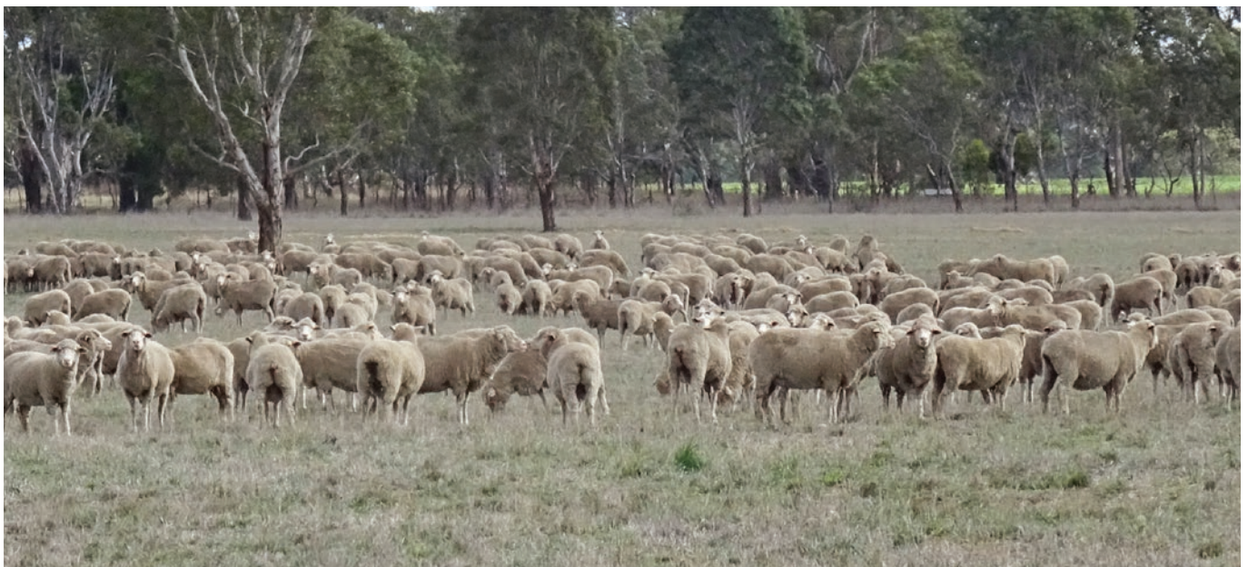
Grazing helps remove excess pasture litter to prepare the paddocks for sub-clover germination.