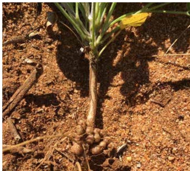
Close-up of tedera nodules (top) and a nodulated seedling (bottom).