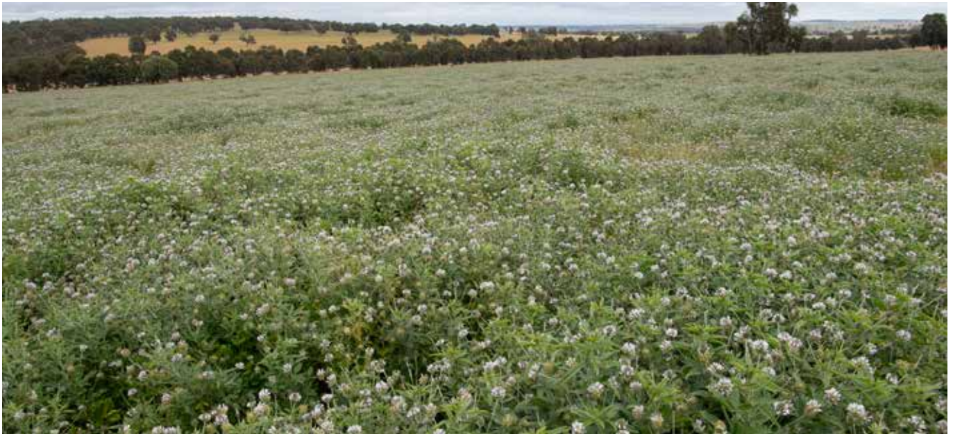
Tедера at flowering.

Bituminaria bituminosa C.H. Stirton (tedera) is widely distributed in all countries surrounding the Mediterranean Sea. It is a diverse species with many botanical varieties adapted to regions with 150–1,000mm of annual rainfall, from sea level to high altitude, and from regions with no frosts to cold mountain climates.