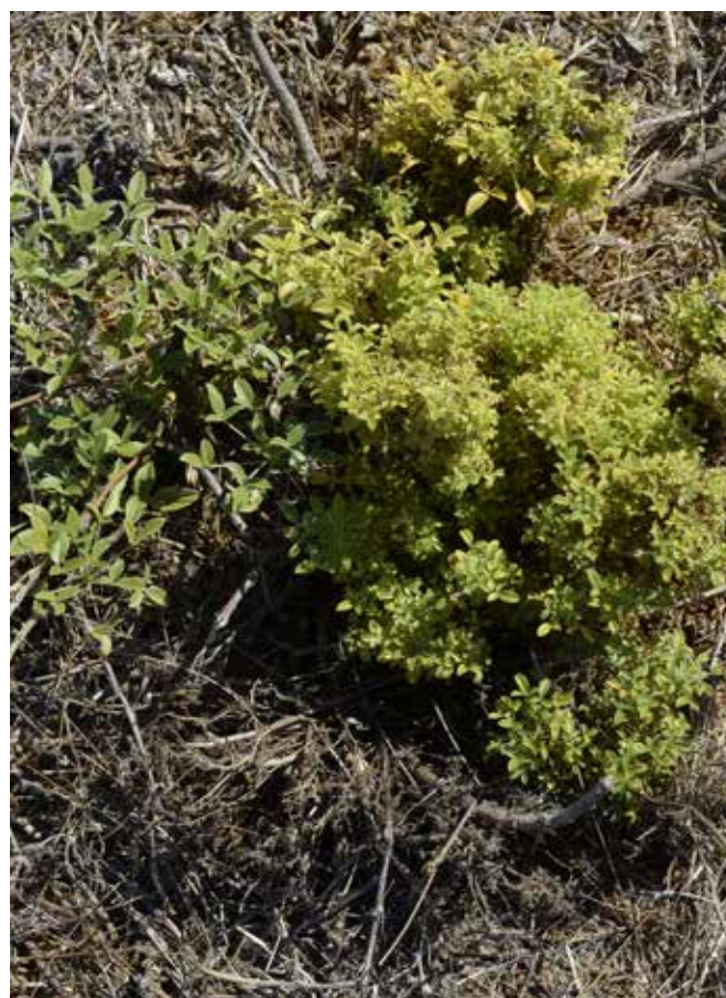
Tедера with parts of the plant showing phytoplasma (BiWB) symptoms and part of the plant growing normally.

Phytoplasma are phloem-inhabiting bacterial organisms transported via leaf-sucking insects, such as leafhopper. Phytoplasma causing 'witches' broom'-type symptoms including stunted growth, with small leaves, shortened