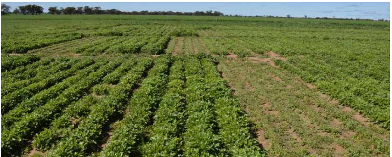
A defoliation experiment at Cunderdin in a one-year-old tедера stand in August, 2018. The experiment examined cutting the pasture to a height of five centimetres twice, four times or eight times a year.

Tедера productivity is maximised by grazing frequently during the drier periods and holding off grazing over the cooler months to support biomass accumulation and to allow roots to grow stronger and deeper.