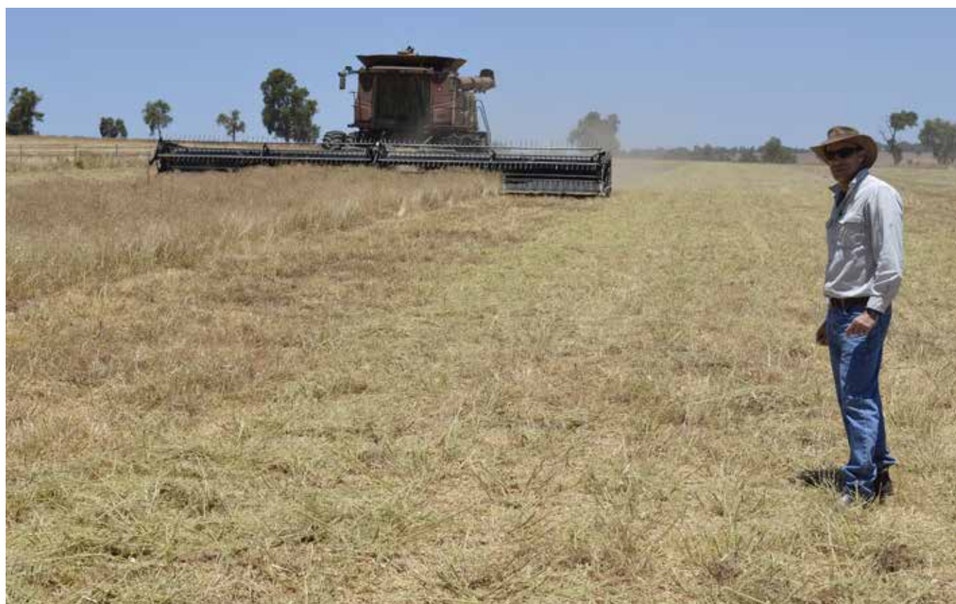
Lanza® tедера harvesting from desiccated seed crop at Dandaragan.

Paraquat and diquat are effective desiccants in adult tедера plants, which can recover well after treatment.