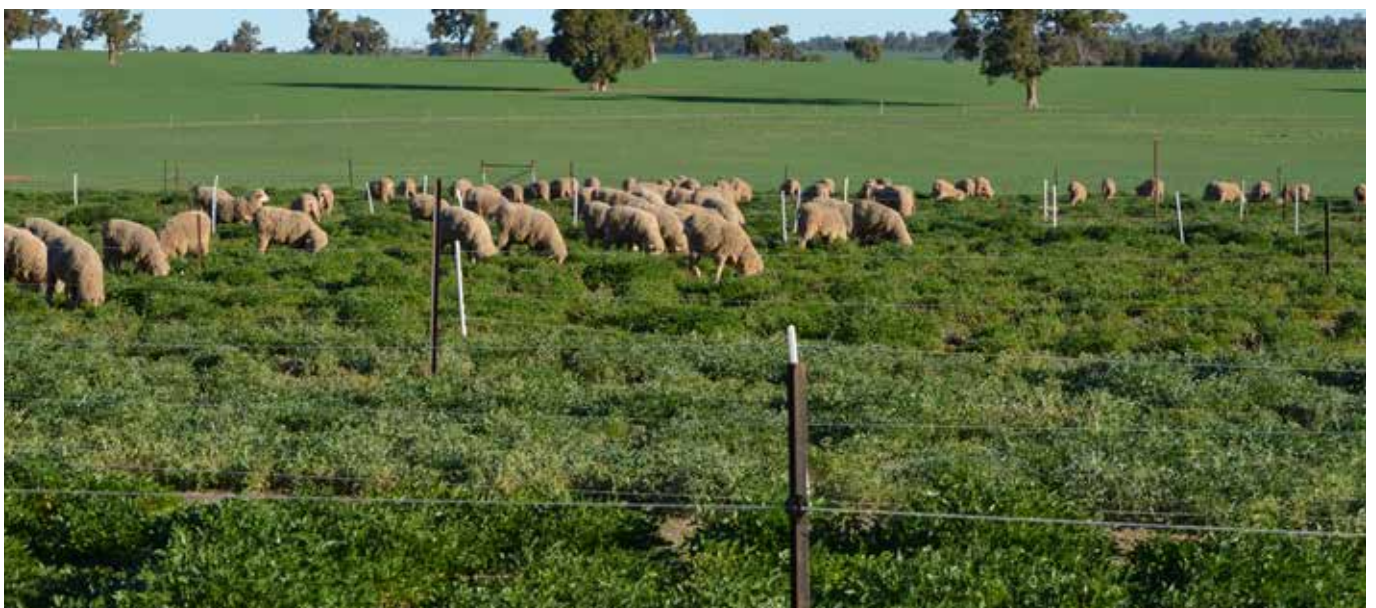
Sheep grazing tedera trials.