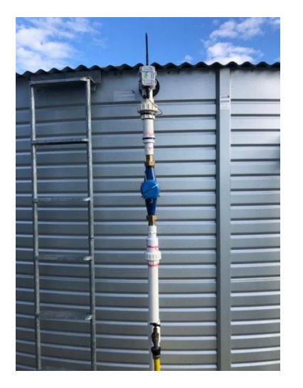
Figure 10: Redbank water flow sensor