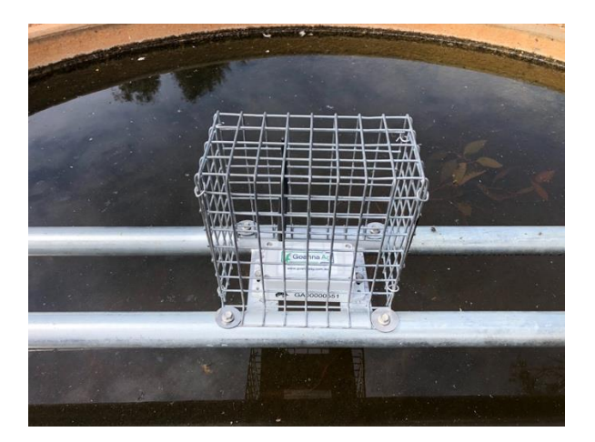
Figure 4: Redbank water trough sensor