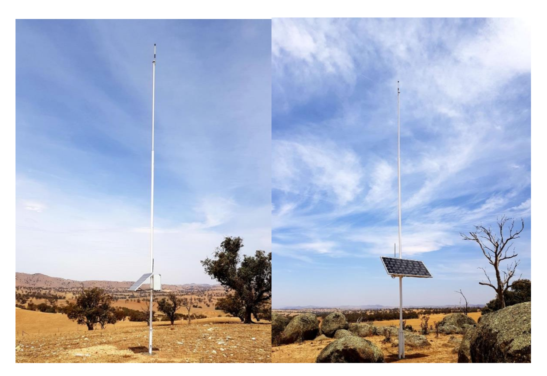
Figure 3: Redbank gateway installation photos