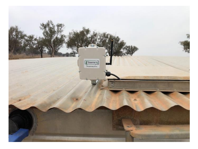
Figure 5: Redbank water tank sensor