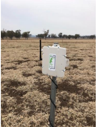
Figure 9: Redbank soil moisture probe