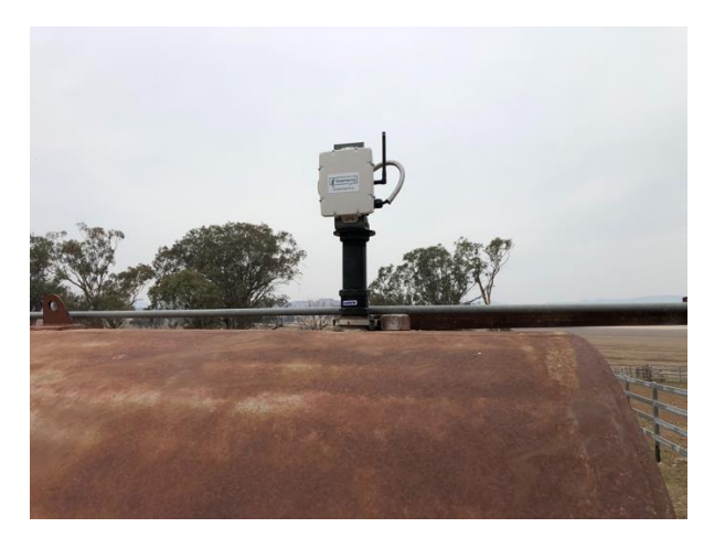
Figure 6: Redbank diesel fuel tank sensor