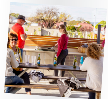
Kitchen & BBQ Areas