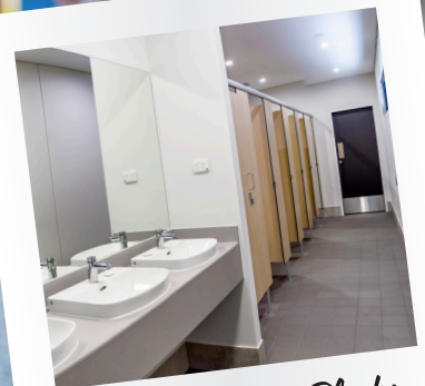
2 New Amenities Blocks