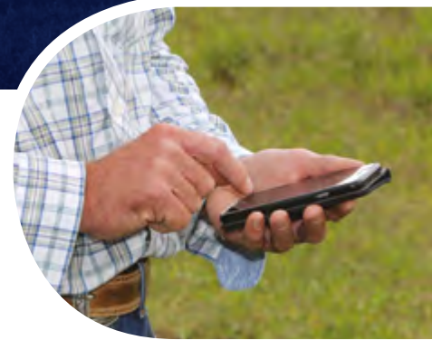
National Vendor Declarations are now available electronically (the eNVD)

The National Livestock Identification System (NLIS) is Australia's system for the identification and traceability of cattle, sheep and goats. The NLIS combines three elements to enable the lifetime traceability of animals: a visual or electronic ear tag, a Property Identification Code (PIC) for identification of physical location, and an online database to store and correlate the data. Visit www.nlis.com.au