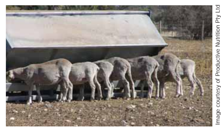
In high feed cost systems, minimising the time lambs spend on feed is critical for profitability.

Growth rate is the rate at which lambs gain weight, expressed in grams per day. Lambs generally need to be growing in excess of 300g/day to be profitable. The efficiency at which lambs convert feed to liveweight gain further influences profitability. This efficiency is expressed as a feed conversion ratio (FCR) – the amount of feed eaten (on an 'as fed' basis) per kilogram of liveweight gained. Growth rate is currently the major determinant of profitability, because the option to select animals on FCR is not currently available.