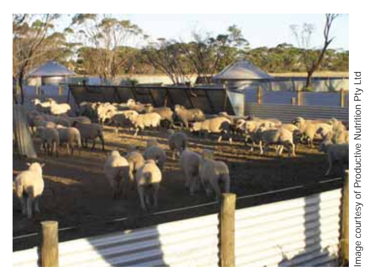
Provide shade and shelter to protect lambs from heat and cold stress.

Common diseases of intensive finishing systems are outlined in Table 2.