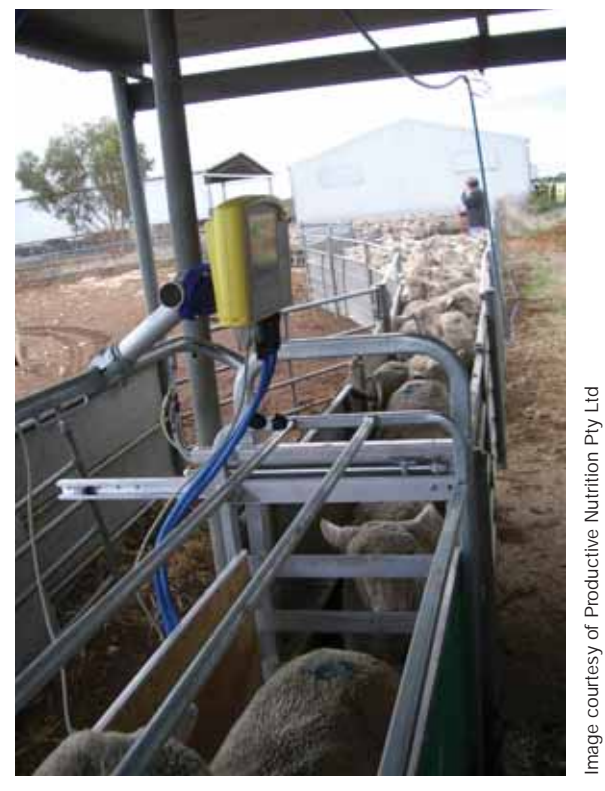
Monitoring lamb performance through regular weighing and fat scoring enables more effective management.

Individual animal performance and management can have a big impact on profitability. Consideration should be given to the opportunity cost of not individually identifying and weighting lambs. When lambs are considered as groups rather than individuals, many poor performing lambs are concealed by the averages.