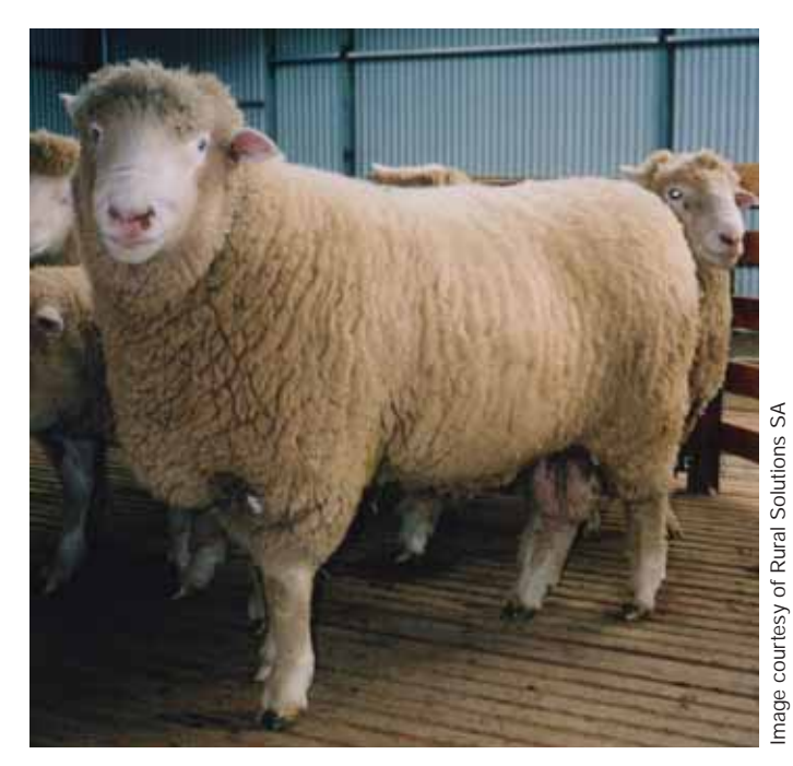
Select lambs from sires with post weaning weight ASBVs of +6kg or greater.

Lambs with higher birth weights have been shown to have reduced total feed intake, reach market weight earlier and be leaner, and are therefore more efficient.