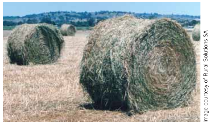
Fibre is provided from roughage such as hay.

In addition, the total diet should contain a minimum of 30% neutral detergent fibre (NDF) for effective rumen function. NDF is the chemical measurement of slowly digested fibre.