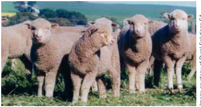
Price margin is determined by the buy-in price of feeder lambs (pictured) entering the finishing system and the sale price of finished lambs.

Growth rate is the rate at which lambs gain weight, expressed in grams per day. Lambs generally need to be growing in excess of 300g/day to be profitable. The efficiency at which lambs convert feed to liveweight gain further influences profitability. This efficiency is expressed as a feed conversion ratio (FCR) – the amount of feed eaten (on an 'as fed' basis) per kilogram of liveweight gained. Growth rate is currently the major determinant of profitability, because the option to select animals on FCR is not currently available.