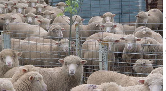
Reduce price risk by securing forward contracts for the minimum number of lambs to cover cost of production.

Maximise potential returns by focusing on carcase and skin quality. Ensure lambs are presented correctly for sale and meet market requirements, minimise stress during handling (bruising), and minimise grass seed and faecal contamination.