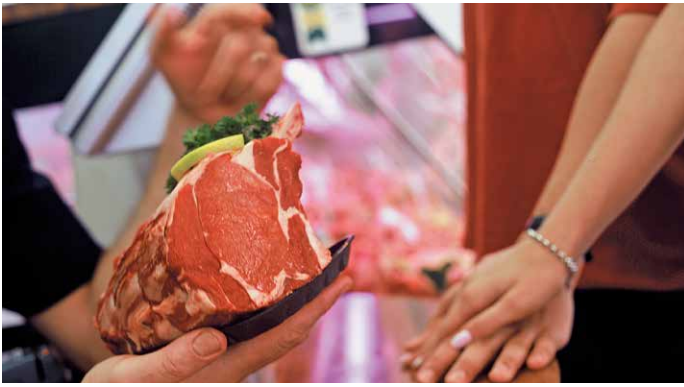
A butcher showing MSA quality meat.