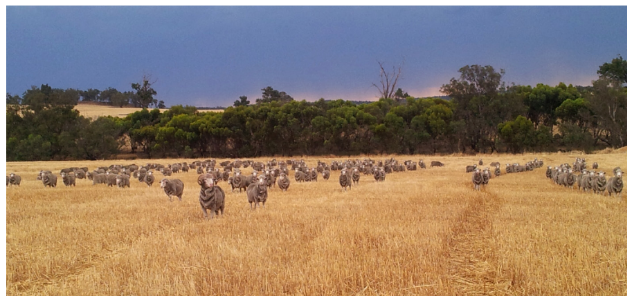
WA medium rainfall top 20% by return on equity