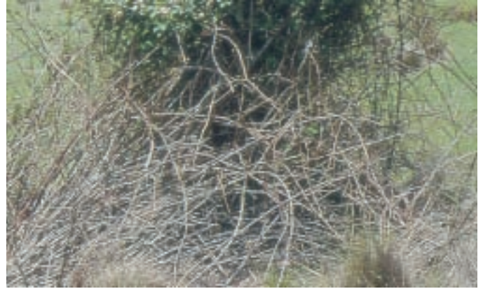
Blackberry controlled by grazing goats.

along fence lines. Goats will also eat any weeds that germinated too early or too late to be affected by herbicides. Similarly, degraded non-arable country with woody and other weeds may be reclaimed by goat grazing.