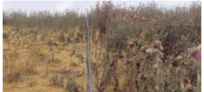
No nodding thistle: goats grazed the left paddock.