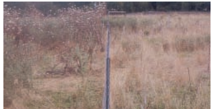
Variegated thistle control: goats were grazed in the right paddock.