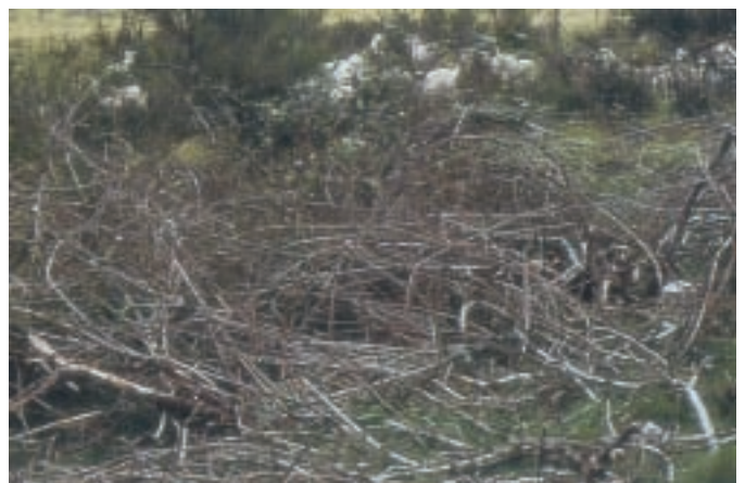
This is all that remains of scotch broom after goats graze it.

Dense growth of scotch broom is greatly reduced within two years if goat grazing at a level that completely defoliates the weed. Control can be achieved within another two years, provided all seedlings are eaten.