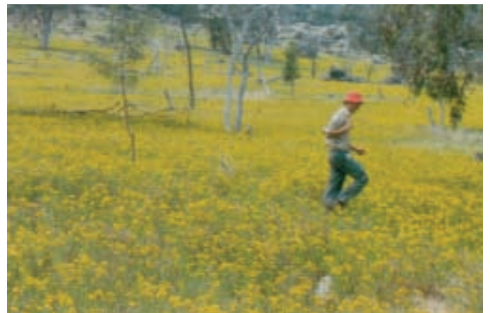
A severe infestation of St John's wort at Wyangala.

Many grazing management strategies have been tried in an effort to control the weed. The best strategy used so far in the most difficult situation, large paddocks in hill country, has been the combination of non-fibre producing goats and Santa Gertrudis cattle.