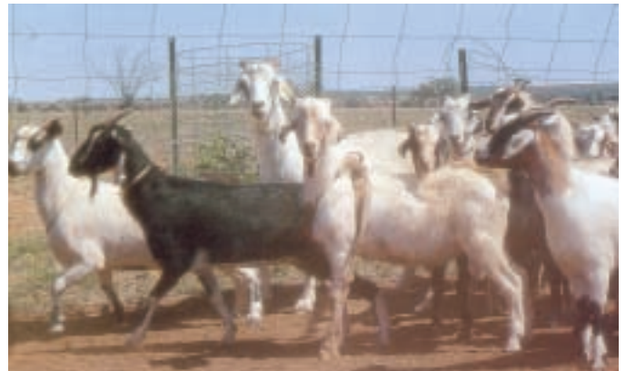
Feral low grade cashmere or meat-type goats (above) are recommended for weed control.

The Australian goat industry consists of meat, fibre and dairy sectors, all of which can be employed for weed control at various stages of the production cycle. Specialist meat-producing goats, Boer goats, rangeland goats and their crosses are most commonly used for weed control. Fibre-producing Cashmere and Angora goats are also well suited to weed control, although care should be taken to avoid fibre entanglement and contamination. These are generally only used off-shears and when the risk of cold stress is at a minimum. Dairy goats also play a role in weed control at some stages in the production cycle, but this is less common due to the intensive nature of the dairy industry.