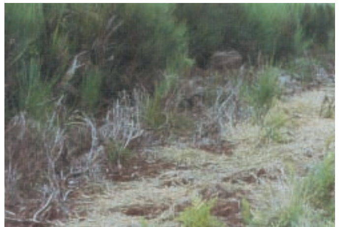
Slash tracks through thick infestations (in this case, scotch broom) to allow goat access.

In dense infestations of woody weeds such as blackberry, scotch broom or gorse, slash paths through the infestation to allow greater access for the goats.