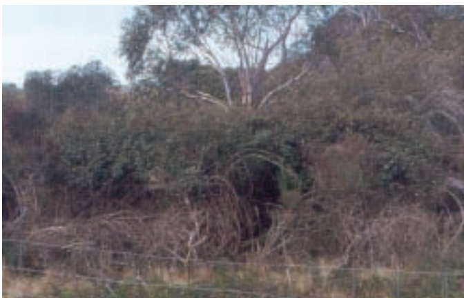
Fence in dense infestations. By confining the goats it ensures increased grazing pressure on the weed.

For localised woody weed infestations it may be best to isolate the infestation with fencing. This has two benefits: it confines your goats to the infested area, so that fewer goats may be required for the job of controlling the weed; and it preserves the remaining pasture for your sheep or cattle.