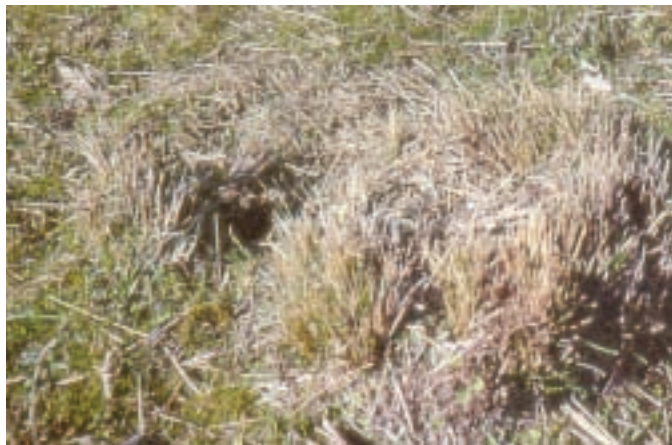
Grazing of poa tussock prevents shading of surrounding pasture, allowing it to spread.

Remember to assess seed head removal and pasture availability, and adjust stock numbers accordingly.