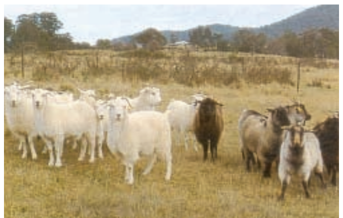
Goats graze broom (rear) at all stages of its growth.