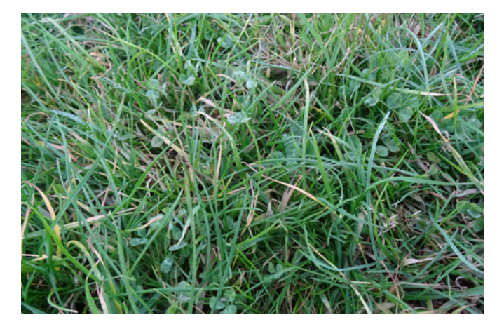
Lax grazing leads to sub-clover becoming shaded by grasses and reduced leaf initiation.

Maximum sub-clover leaf production is achieved by frequent heavy grazing, rather than light grazing and long periods of spelling. Sunlight reaching the crown of the sub-clover plant stimulates leaf production and shading reduces leaf production.