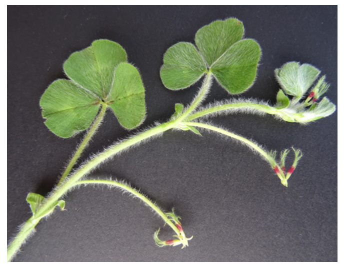
A sub-clover runner with the newest leaf emerging from the end of the runner and flowers at the stem intersection of each leaf.