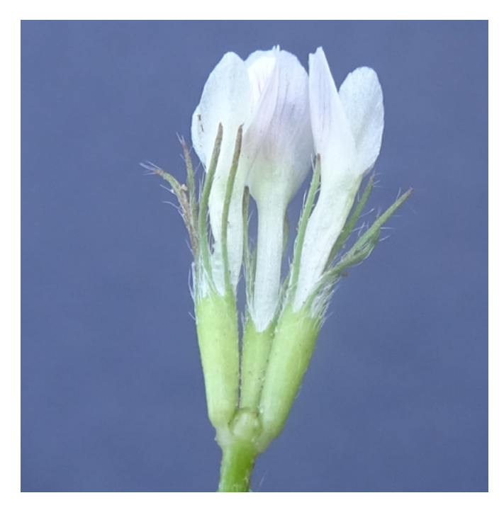
Sub-clover flowers on cultivar Riverina with a green flower tube.