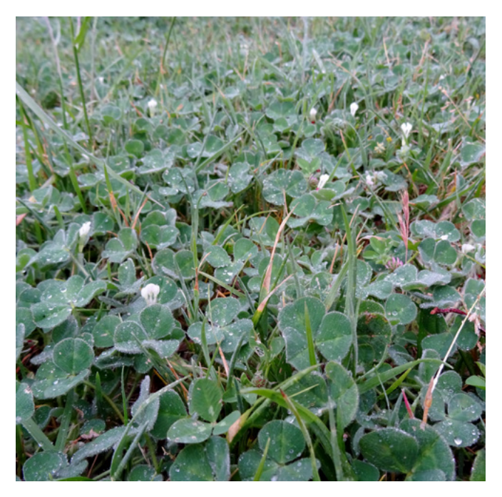
White flowers visible on sub-clover in a pasture.

Regular inspections should be made for pests, especially redlegged earth mites which can damage the flowers without necessarily appearing to do damage to the leaves.