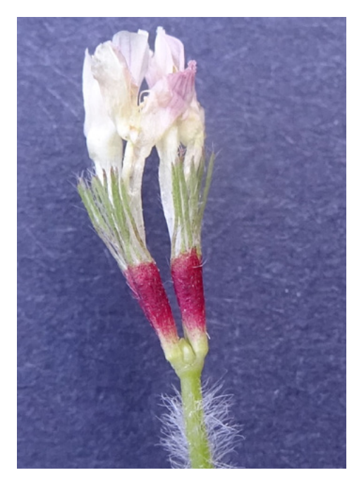
Sub-clover flowers on cultivar Mt Barker showing red pigment on the flower tube.

Sub-clover flowers are easy to observe. They are usually white and have three or four tubular florets. Different cultivars can have different markings, such as red pigmentation.