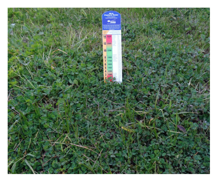
Grazing height to favour sub-clover over perennial grasses.

If more sub-clover is desired, grazing frequently and to 1,000kg DM/ha is necessary.