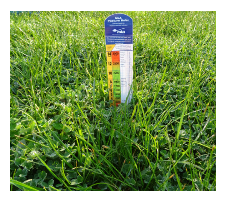
Compromised grazing height to suit both sub-clover and perennial grasses.

Flowers and leaves grow from the same position on the runner. The flowers along each runner will be at different stages of maturity, with the oldest flower closest to the crown of the plant and the newest flower at the end of the runner.