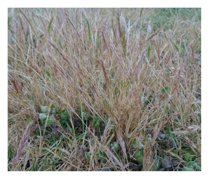
Dry silver grass will release a natural toxin that reduces the germination of sub-clover.

A compromise between protecting the soil, achieving hard seed breakdown and reducing the toxic effects is