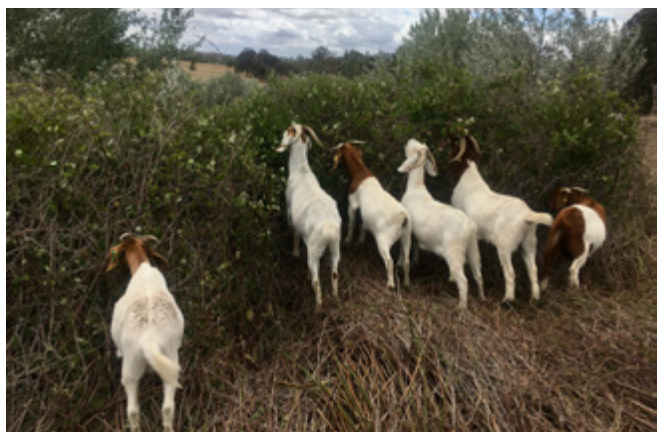
Goats preferentially grazing blackberry near Canberra

The common thistle is an example of a weed that is not eaten year-round. In a pasture infested with young thistles, goats compete with sheep and cattle for the pasture, avoiding the young thistles. During flowering, however, the thistles are palatable to goats but not sheep and cattle, meaning competition for forage is considerably less.