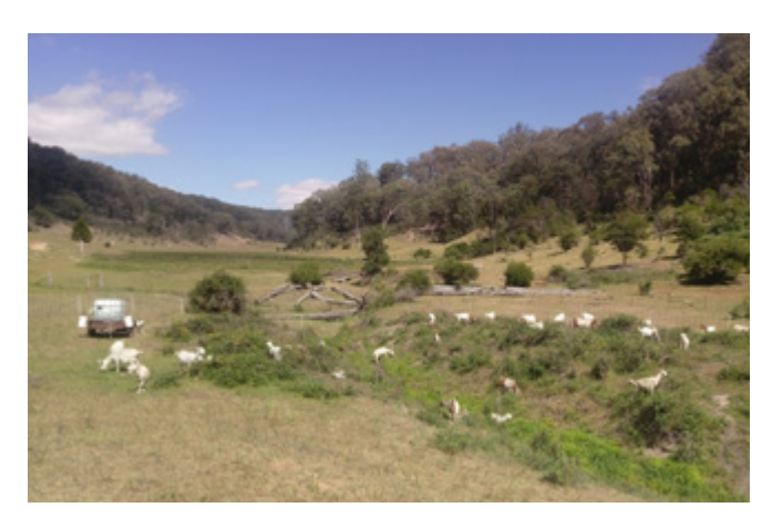
Temporary water is provided here via a shuttle on a trailer

Goats generally dislike wet conditions. Animals at high risk of cold stress include fibre goats with short fibre length in winter and newborn kids. Shelter may be required for such animals. Temporary shelter and water are important considerations when confining goats for weed control.