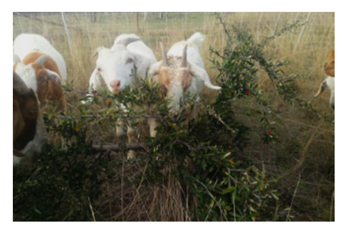
Goats can be used to help control cotoneaster but as with all potentially toxic plants, care should be taken<sup>1</sup>

Remember to assess seed head removal and pasture availability and adjust stock numbers accordingly.