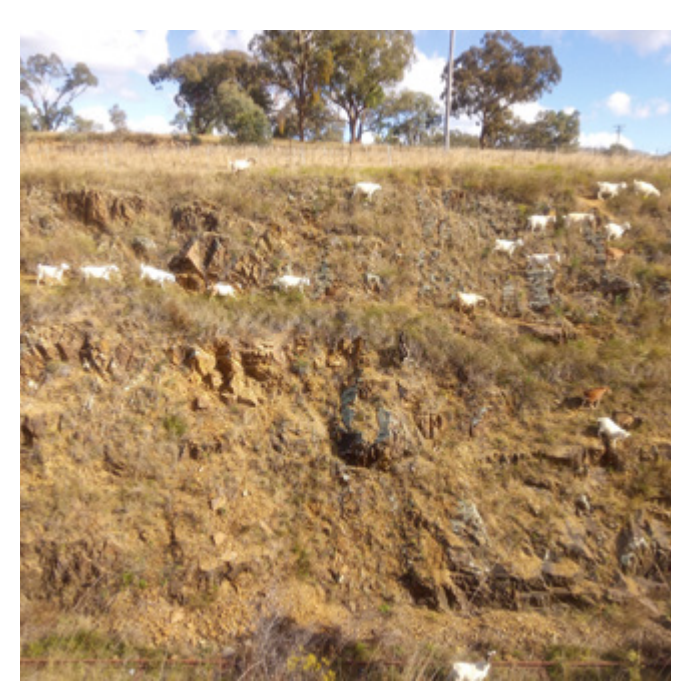
Goats can effectively control weeds on steep slopes which may otherwise be inaccessible