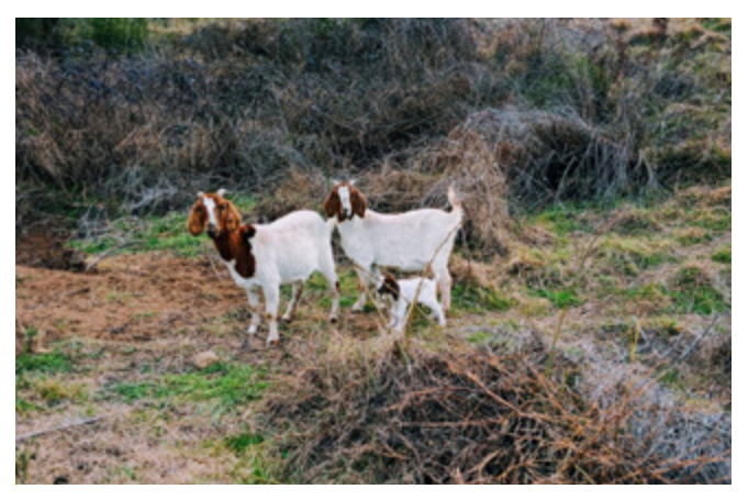
Breeding goats can be used for weed control provided potential threats such as predators are understood and managed

Where predators are thought to be a problem, the basic tactic is to kid at the same time as lambing or when most producers in the district are lambing or kidding. Food for predators is consequently more plentiful and diverse. Baiting with 1080 for foxes and pigs can be effective in some areas and may be required.