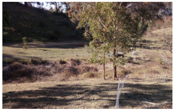
Temporary, prefabricated electric fencing was used to maintain a high stocking rate to control the blackberry in this gully