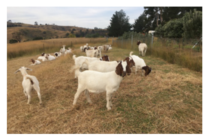
Goats being used in the Bega Valley to control African love grass. They find the regrowth and seeds particularly palatable.

Monitor the grazing impact of goats on weeds and pasture during the period when the weed is most palatable to the goats (Appendix). Ensure there is sufficient pasture to satisfy the nutritional requirements of the animals and to compete effectively with the targeted weeds.