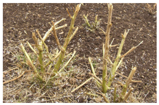
Despite generally being of low palatability, goats will at times heavily graze Bathurst burr as shown in this image

Knowing which category a weed belongs to allows you to determine how many sheep, cattle and goats are required to achieve control and whether an integrated strategy is required.