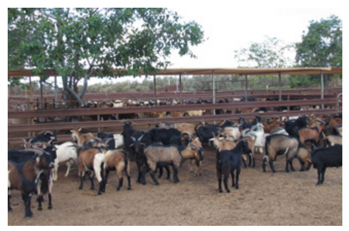
Sheep and cattle yards can generally be modified to handle goats

Existing cattle and sheep yards may be modified to accommodate goats. On wool-producing properties, care must be taken to avoid fibre contamination when sharing sheep and goat handling facilities, especially shearing sheds and yards. For more information on fencing and infrastructure, see Setting up your goat property on the MLA Goats hub.