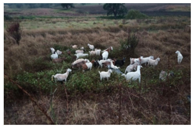
High grazing pressure can be applied through the strategic use of temporary fencing. In this case, prefabricated electric fencing is used to contain goats on blackberry bushes.

Localised woody weed infestations may be best controlled by fencing them off and intensively grazing with goats. This has the added advantages of reducing the number of goats required to achieve control and preserving the remaining pasture for your sheep or cattle.