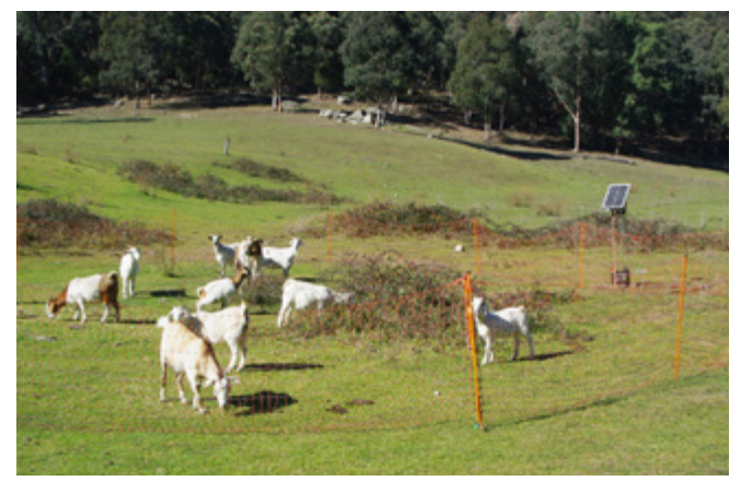
Fencing can be temporarily improved with prefabricated electric fencing to concentrate grazing pressure on the target weeds. Note the solar-powered energiser which can allow for electric fencing away from mains power.

Electric fencing can be used to effectively control goats.