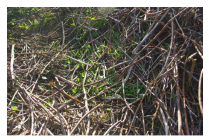
Heavily grazing blackberry with goats can allow pasture species to grow through the blackberry canes and compete more effectively

In most cases it is also important to have a competitive base pasture to out-compete the weed and colonise bare areas. Clover is a good choice, as it is not highly selected by goats, and should be a major component of the pasture (more than 30%). It is advisable to apply fertiliser at the start of the weed control program to give the clover a competitive advantage. The application rate will depend on the paddock's fertiliser history and level of soil phosphorus.