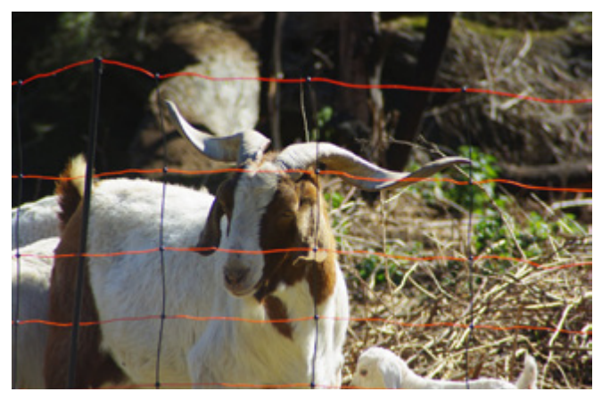
Goats are intelligent and will soon learn to respect well maintained electric fences

For information on aspects of fencing for goats see the Going into Goats guide on the MLA goat hub.