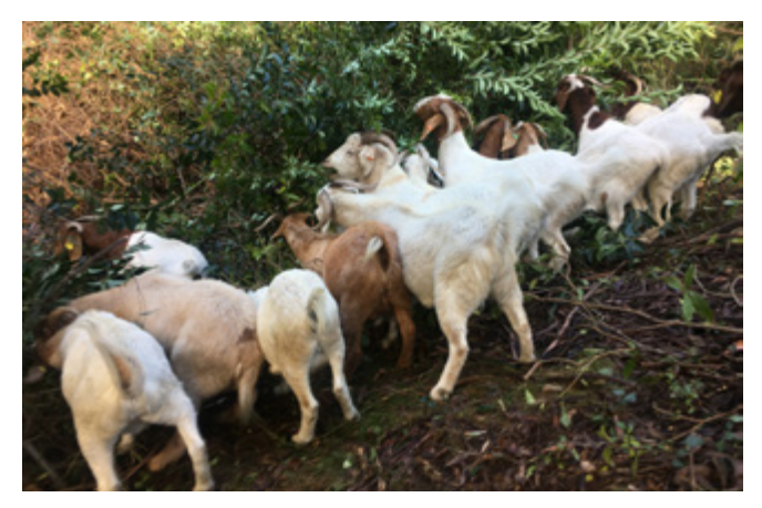
Boer cross goats grazing privet which is highly palatable