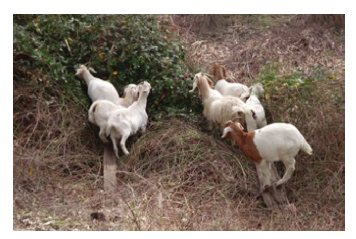
Planks of wood can be used to allow goats to graze inaccessible parts of plants, in this case, blackberry

In dense infestations of woody weeds such as blackberry, scotch broom or gorse, slash paths through the infestation or provide walkways to allow greater access for the goats.