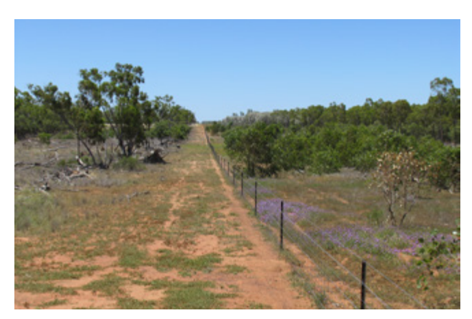
Goats can be used effectively to control regrowth along firebreaks or on cleared country. In this image taken at Mitchell, Queensland, goats were used in the paddock on the left to maintain a cleared firebreak, but not on the right.