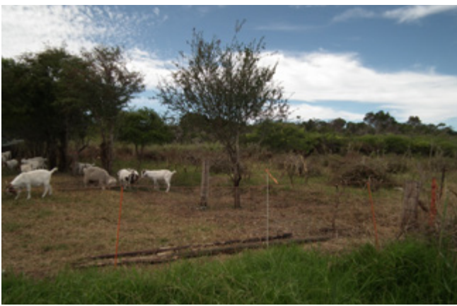
Strategic grazing of privet as part of an integrated control campaign