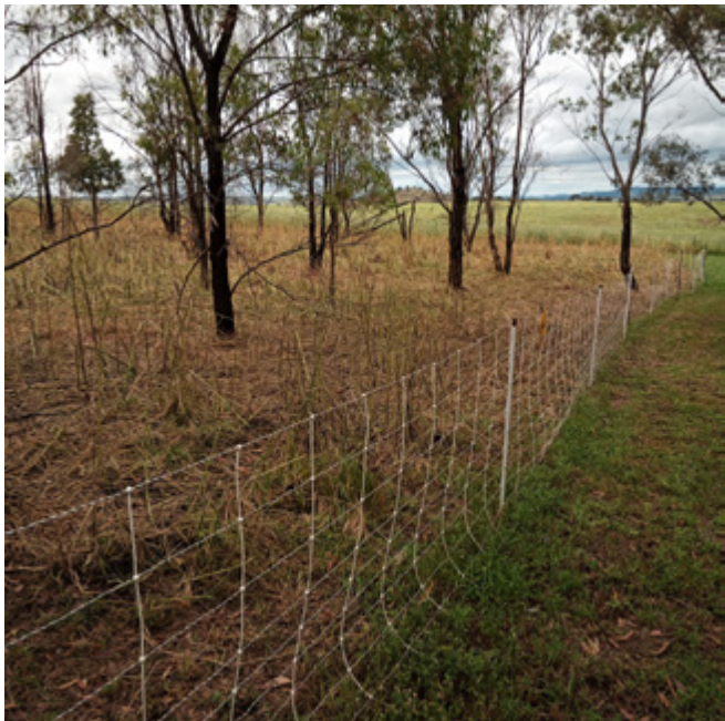
Goats were used at a high stocking rate for two weeks to control Pattersons curse during flowering; be aware of the risk of nitrate poisoning