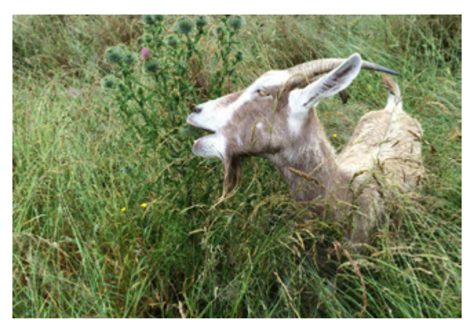
Goats are very effective at controlling thistles as they will preferentially graze the flower, preventing seed set

"Remember to assess seed head removal and pasture availability and adjust your stock numbers accordingly."