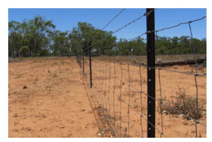
Permanent fencing designed to secure goats is similar to that which will contain a first cross breeding flock