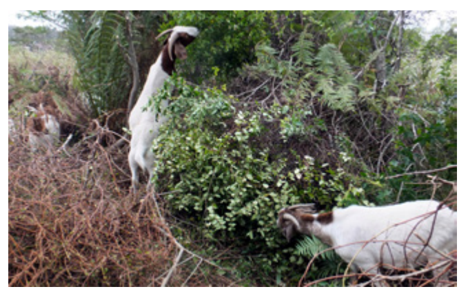
Goats being used to control privet