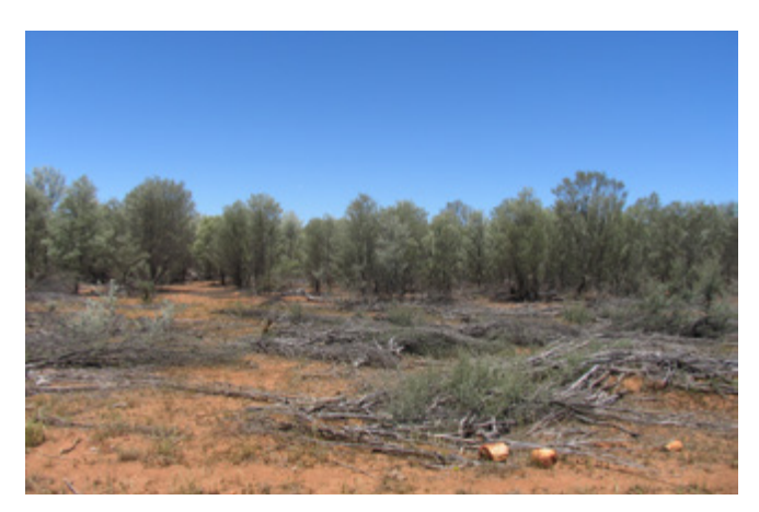
Goats can be used here to control regrowth after clearing

Goats can be used in extensive farming systems to control woody weeds, particularly on cleared country and firebreaks.