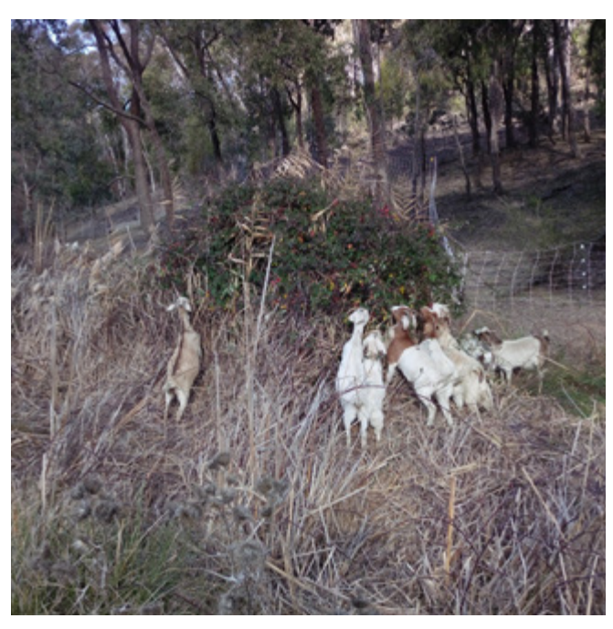
Blackberry controlled by grazing goats

Goats may also be used in conjunction with conventional weed control methods. They are efficient browsers and grazers of weeds that may have been missed during spraying and effectively control residual weeds in rocky outcrops, corners, around trees, on steep slopes and along fence lines. Goats will also eat any weeds that germinated too early or too late to be affected by herbicides. Similarly, degraded non-arable country with woody and other weeds may be improved by goat grazing.