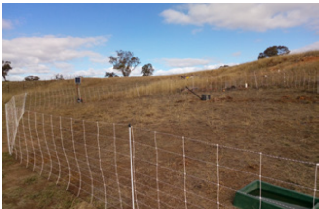
Goats can control African lovegrass as shown in these before and after images. The regrowth is particularly palatable and continued grazing can help deplete the plant's reserves.