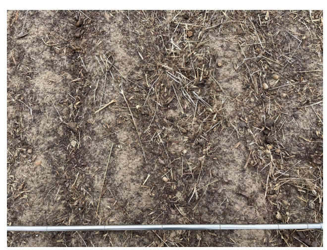
4. DEEP RIP + INCLUSION