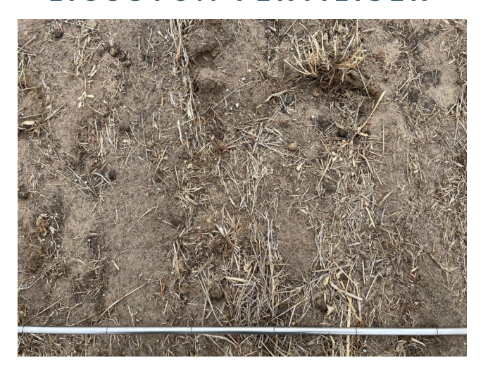
3.CHISEL PLOUGH + MIX