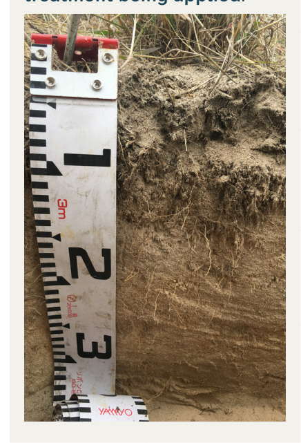
Image 1. Soil profile from the deep sand dune prior to any treatment being applied.

These treatments are tested against a no-tillage control (Image 2) and will be monitored until 2025.