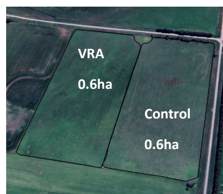
Figure 1 Aerial view of the site

The Spittles' Ascot property is a mixed cropping and grazing enterprise comprising of 700 cross-bred ewes stocked at approximately 10 dry sheep equivalent (DSE)/ha. The mixed system allows for summer stubble grazing, and their pasture system is based on phalaris and clover.