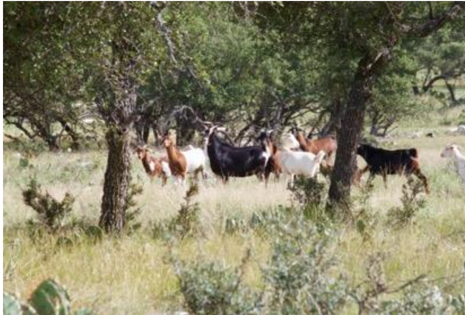
Spanish x Boer goats, Texas, USA.