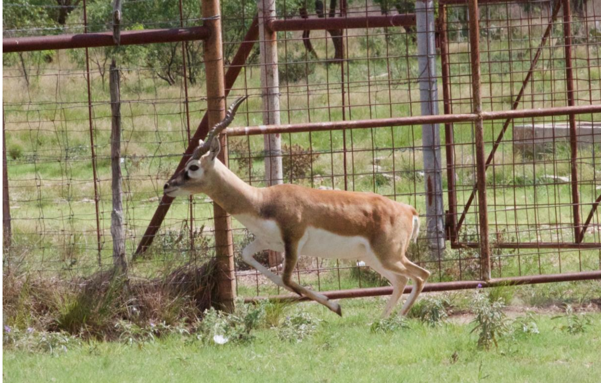
Greater Kudo, Texas.