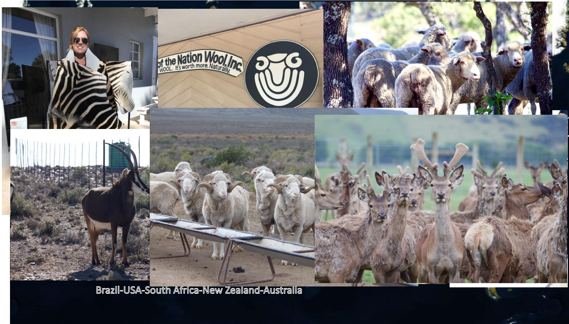
Brazil-USA-South Africa-New Zealand-Australia