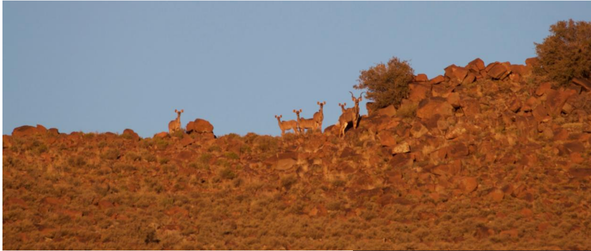
Greater Kudu & Lucerne bales, South Africa.