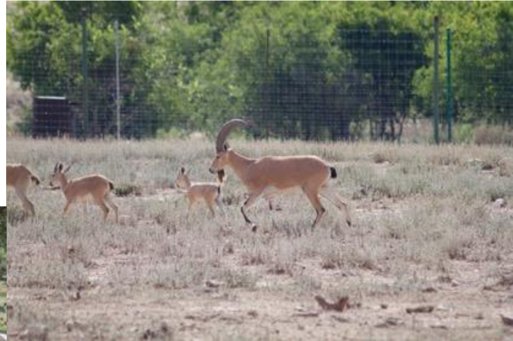
Nubian Ibex ( Capra ibex ), Texas, USA.