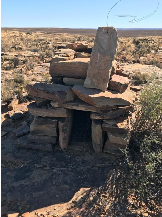
Jackal trap, South Africa.