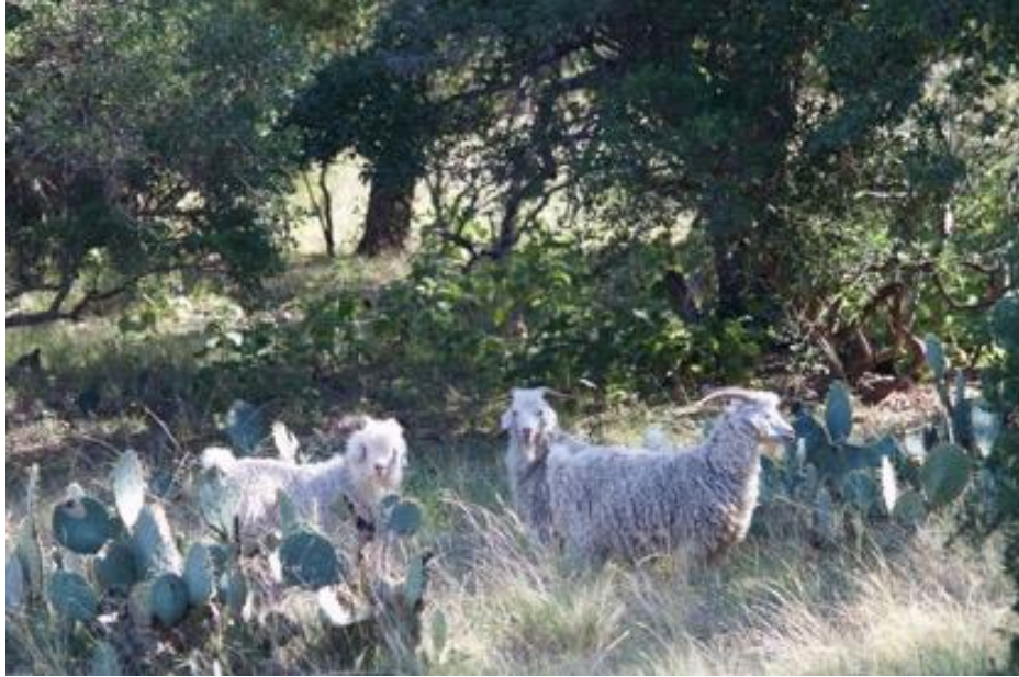
Angoras, Texas, USA.