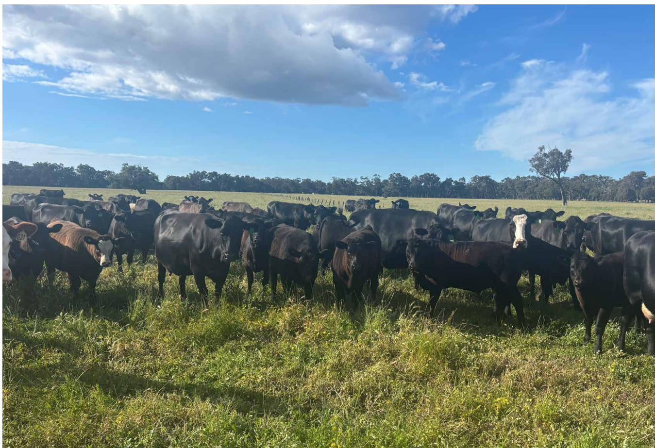
Peter Dawson runs around 80 to 90 Angus-Friesian cross breeders joined to Angus bulls