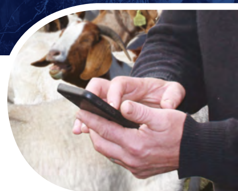
National Vendor Declarations are now available electronically (the eNVD)

The National Livestock Identification System (NLIS) is Australia's system for the identification and traceability of cattle, sheep and goats. The NLIS combines three elements to enable the lifetime traceability of animals: a visual or electronic ear tag, a Property Identification Code (PIC) for identification of physical location, and online database to store and correlate the data. Visit www.nlis.com.au