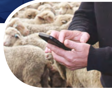
National Vendor Declarations are now available electronically (the eNVD).

The National Livestock Identification System (NLIS) is Australia's system for the identification and traceability of cattle, sheep and goats. The NLIS combines three elements to enable the lifetime traceability of animals: a visual or electronic ear tag, a Property Identification Code (PIC) for identification of physical location, and online database to store and correlate the data. Visit www.nlis.com.au