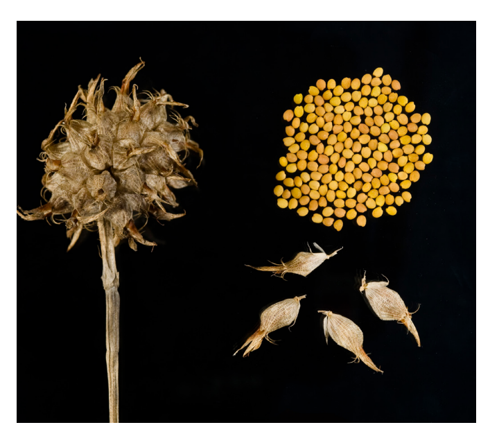
Scarified and podded bladder clover seed