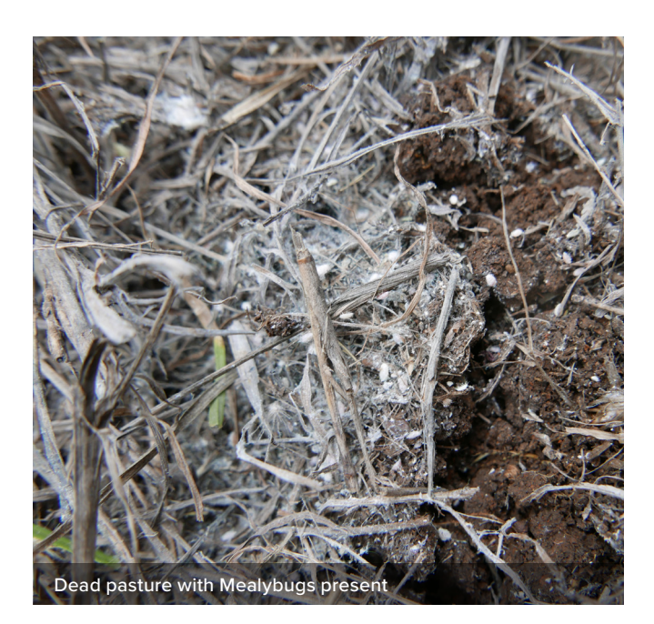
Pach of pasture dieback

1. Findings from field trials – what has worked and what hasn't.