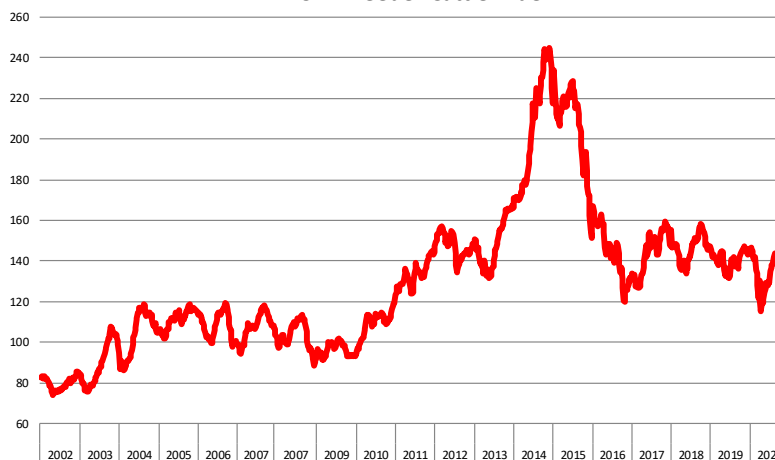
CME Feeder Cattle Index