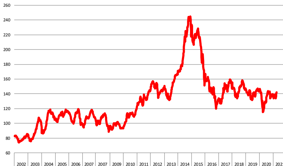
CME Feeder Cattle Index